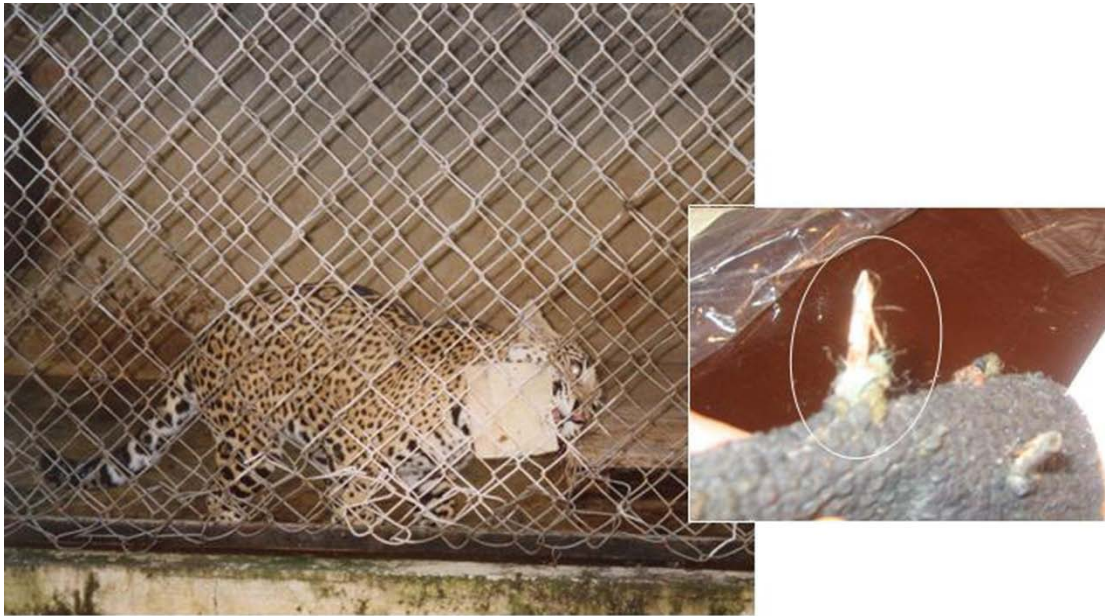
Fig. 2. (a) A jaguar ( Panthera onca ) rubbing against the hairsnare baited with lures at the Tuxtla Gutierrez Zoo in Chiapas; (b) a hair sample obtained from the same jaguar.

(n=1), and jaguarundi (n=1). Other species identified using the hair snares were gray fox ( Urocyon cinereoargenteus , n=1), tayra ( Eira barbara , n=3), coati ( Nasua narica , n=1), four-eyed opossum ( Metachirus nudicaudatus , n=6), and common opossum ( Didelphis marsupialis , n=16). Eight samples were of unknown identity and two samples contained evidence of Mustelids. However, these were excluded due to the low confidence in identification.