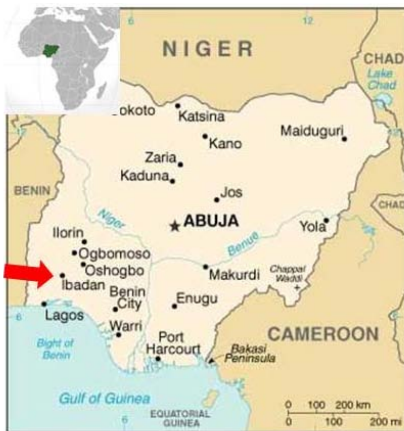
Fig. 1: Map of Nigeria showing the location of the study area, located in Ibadan (red arrow).

The field gene bank of the National Centre for Genetic Resources and Biotechnology (NACGRAB) is a protected area earmarked for the conservation of forest trees, fruit, oil, roots, and tuber crops and all other plants whose seeds are recalcitrant and cannot be successfully stored in cold seed gene banks. It is about 12 hectares wide, located within latitude 7° 22' north of the equator and longitude 3° 50' east of the Greenwich Meridian (Fig. 1)