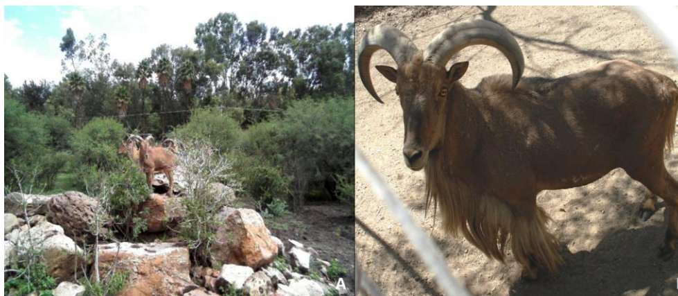
Fig. 1. (A) Aoudad group at “Safari” (semi-free enclosure) of Leon Zoological Park. (B) Male used in the experiment.

The reason for using only one male aoudad in this work was because the Leon Zoological Park only had two males available for this study and one of them is a young male with an unproven fertility. The detection of estrus can be determined using a vasectomized male or a heterospecific male (buck or ram); however, the feasibility of using a male of another species for the detection of estrus in wild goats has not been established. In addition, estrus detection in wild females can generate stress just before the moment of ovulation. We therefore decided to use a natural approach, only introducing the aoudad male with proven fertility, and to monitor the copulation behavior.