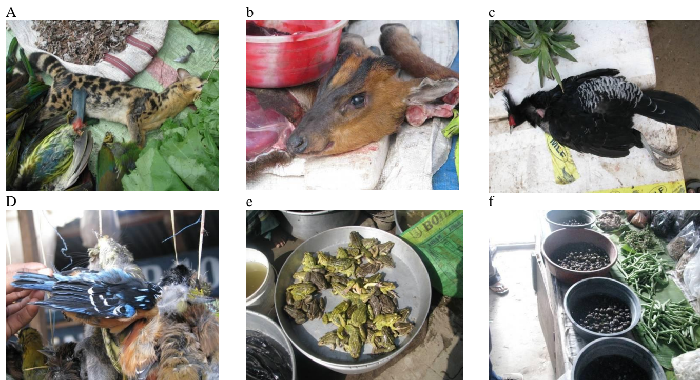
Fig.3. Representation of wild animals sold in Tuensang market, eastern Nagaland; (a) Spotted Linsang Prionodon pardicolor (b) Red Muntjac Muntiacus muntjak (c) Kalij Pheasant Lophura leucomelanos (d) Beautiful Nuthatch Sitta formosa (e) Amphibians (f) Molluscs.

Traditionally, the people of Nagaland largely depend on wild animal meat for their protein requirement. During winter, the temperature of the region dips to < 8^{\circ}\text{C} and animal protein is an important and staple food for the local inhabitants. Enquiry among the vendors revealed that the number and diversity of birds and mammals brought to the market declined during the last five years. Culturally important birds such as the great hornbill Buceros bicornis and Blyth's tragopan Tragopan blythii and mammals such as goral Nemorhaedus goral were sold about 5-10 years ago at Tuensang market, but were not observed during this study. Animals sold in Tuensang market were smaller (Table 3) compared to the trophies found in houses. Vendors believed that these animals have been locally extirpated due to over-exploitation and massive habitat destruction. Tribes used catapults for hunting small birds and squirrels and bow and arrows for killing larger mammals a decade ago. Vendors believe that use of air guns and other sophisticated weapons became common in the last 5-10 years. They also revealed that in recent ( <5 ) years, people have switched from consuming wild animals to domesticated animals such as chicken, pig, dog and cattle. However, data on the quantities of these were not recorded during this study.