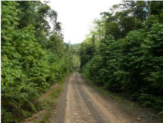
Fig. 2a. The dense cover of Piper aduncum along the old road in southern part of the concession