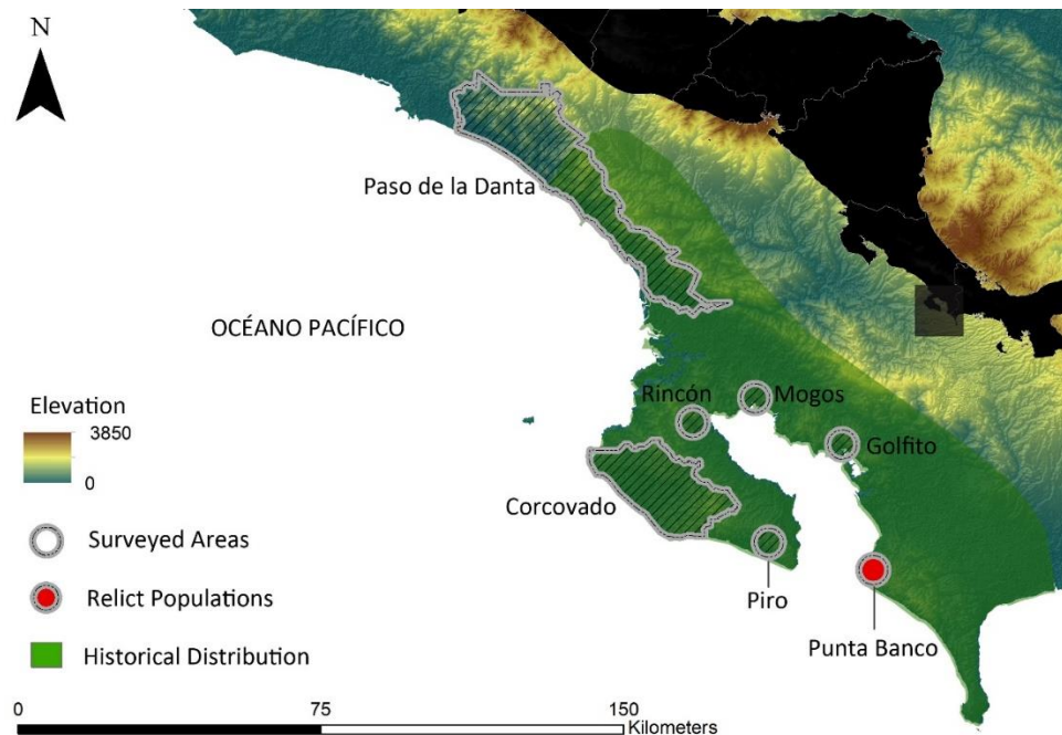
Fig 1. Map of Costa Rica showing historical distribution and surveyed areas since 2000 of the South Pacific streamside frog Craugastor taurus .

In addition to the historic sites, on December 2, 2011 we also conducted a survey at Punta Banco, in extreme southeastern Costa Rica, where we sampled two streams: an unnamed stream ( 08^{\circ}21'25'' N, 83^{\circ}08'03'' W, 47 m asl) and Quebrada Banco ( 08^{\circ}21'41'' N, 83^{\circ}08'56'' W, 24 to 36 m asl). We used standardized nocturnal visual encounter surveys and recorded duration (minutes) and distance (meters) for each survey [31]. In every stream we estimated density as the number of individuals encountered per 50-meter stream stretch. We also determined sex and age class, and recorded basic habitat use information. We collected two voucher specimens, one from each stream (Fig 2), which are housed in the Museo de Zoología at Universidad de Costa Rica (UCR 21492–21493). Because frogs of the C. punctariolus species group are notoriously difficult to identify [12], vouchers of this Critically Endangered frog were collected in order to verify the species identity. By comparing our vouchers with other museum specimens we are sure of proper species identification and can proceed with effective conservation efforts [32].