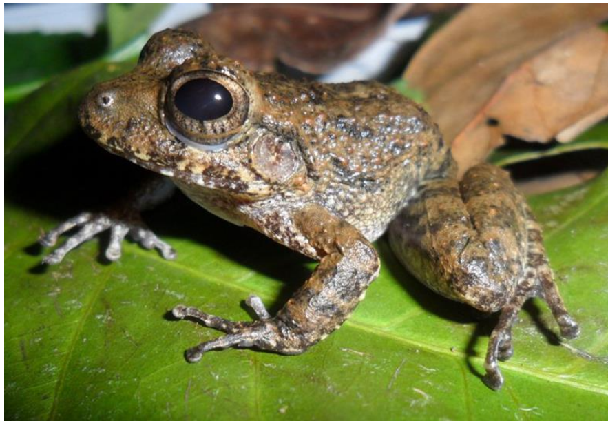
Fig. 2. Adult male of the South Pacific streamside frog Craugastor taurus collected at Punta Banco.

In our limited sampling on December 2, 2011, we observed sixteen frogs of Craugastor taurus in the unnamed stream (eight adult frogs, four males, and four females; 0.46 frogs/50 meters; 2.81 person hours; 864 m). At Quebrada Banco we observed fourteen individuals (eight males, three females, and four juveniles; 1.63 frogs/50 meters; 2.45 person hours; 459 m).