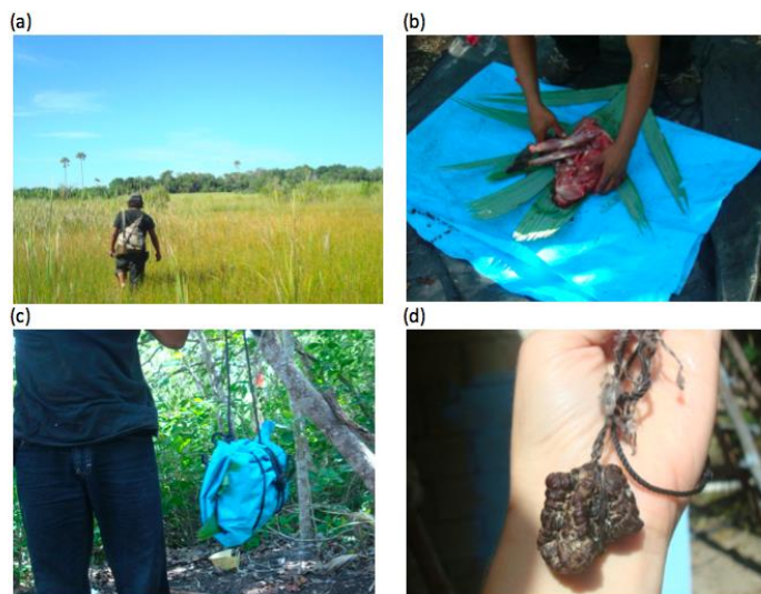
Fig. 2. Images of contemporaneous subsistence hunting in LPBR: (a) Peasant-hunter during an individual hunting trip, approaching a peten in a typical hunting landscape of the region; (b) Peasant-hunter wrapping a small prey in palm leaves and plastic to conceal it and transport it back to the community; (c) View of the prey wrapped and ready for transport by peasant-hunter at the end of his hunting activity; (d) "Deer stone", the most precious talisman for hunters in the region, due to the quantity and type of prey which provides with.

In both communities ( \chi^2 = 0.02 ; P > 0.05 ), the majority of interviewees expressed enthusiasm for hunting, mainly individually (Fig. 2a), for white-tailed deer. They did not have a preference for a hunting season (especially in El Remate). Opinion was divided among peasant-hunters (ca. 50%; \chi^2 = 0.14 ; P > 0.05 ) about encouragement by their families to practice hunting. In the majority of cases, interviewees perceived a reduction in potential prey (compared to the previous decade) in the vicinity of their community (Table 1).