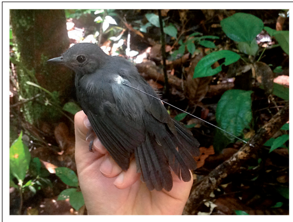
Figure 2. Male Cinereous Antshrike ( Thamnomanes caesius ) with 0.5 g radio telemetry transmitter glued to its back.