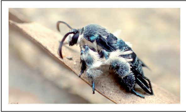
Figure 1. Heterosphecia tawonoides puddling on a dry leaf washed out by the river.

individuals were seen mud-puddling on a sandy/pebble river bank, a behavior recorded only recently for the family Sesiidae (Gorbunov, 2015; Skowron, Munisamy, Hamid, & Wegrzyn, 2015; Skowron Volponi & Volponi, 2017; Szabolcs & Pühringer, 2016).