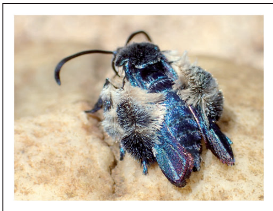
Figure 3. In sunlight, Heterosphecia tawonoides has a strong blue sheen on wings, abdomen, and tarsomeres.

Abdomen: Black with strong blue sheen, smooth-scaled with several short white hair-like scales, bigger and