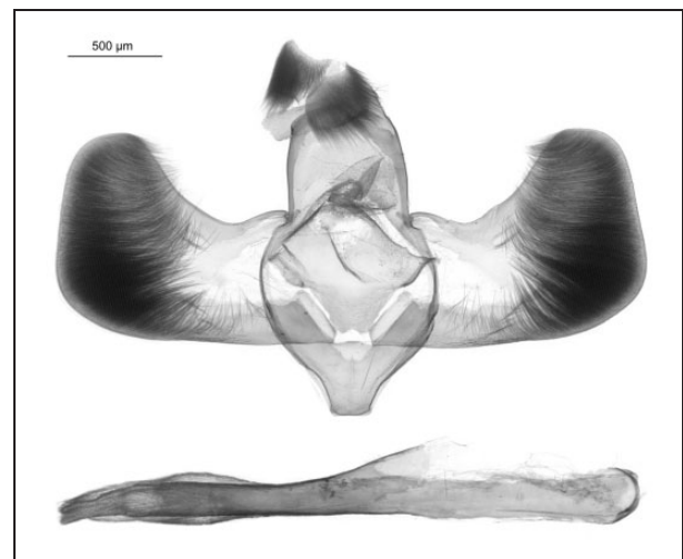
Figure 4. Male genitalia show slight morphological differences from the holotype.

Strong blue sheen on wings (both transparent and scaled areas, Supplementary video TC: 01:44–01:49, Figure 3); Legs and abdomen: Bigger and strongly light-reflecting, metallic blue scales on margins of each tergite form distinct bands in sunlight (Supplementary video TC: 01:00–01:05, 02:50–02:58). Characteristic tufts of hair-like scales present on all tibia but are longest on hind legs, with alternate shiny blue and creamy white coloration (Figure 1). Strongly elongated, creamy white hair-like scales of hind tibia extend interiorly over folded wings and abdomen in natural resting position.