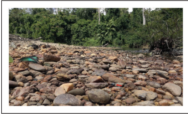
Figure 6. The natural habitat of Heterosphecia tawonoides in Peninsular Malaysia. Arrow indicates the sesiid mud-puddling on rocks.