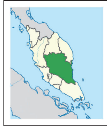
Figure 2. Map of Peninsular Malaysia. Pahang state is marked in green.

Temperature and humidity measurements in the field were made using a TFA Dostmann electronic thermo hygrometer in the shadow each time that H. tawonoides was observed. Photographic and video documentation was made with Olympus TG-3, Sony DSC-RX10, and Sony PXW-FS5 digital cameras. Photographic and video documentation, as well as behavioral observations were made in the natural habitat of H. tawonoides , in three locations (approximately 20 km and 50 km away from each other) in lowland dipterocarp forests of Pahang State, Malaysia (Figure 2). Four individuals were collected in Kuala Tahan, Malaysia, and pinned for morphological analyses. Male genitalia were dissected and prepared as follows: (1) maceration of the abdomen in boiling 10% KOH, (2) dissection in 10% ethanol, (3) dehydration in 30%, 60%, and 100% ethanol, respectively, and (4) mounting in Euparal. Morphological details were studied with a Leica M80 stereomicroscope and photographed using a Leica M205A. Morphology of male genitalia was compared with Figure 7 in the study