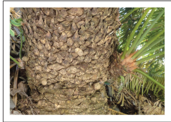
Figure 1. The Pachycaulous C. micronesica Stem Produces Adventitious Buds That Develop Into Adventitious Stems. These side stems can be removed for asexual propagation.

The general appearance of the available adventitious stems was as shown in Figure 1. The range in size was similar for the three species. Length of the cuttings ranged from 5 to 8 cm, and number of leaves per cutting ranged from 2 to 6. All leaves were removed at the base