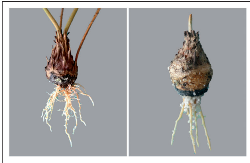
Figure 1. (A) Zamia furfuracea stem cutting displaying healthy adventitious roots 52 days after preparation. Leaf growth occurred prior to root growth (B) Zamia integrifolia stem cutting displaying healthy adventitious roots and simultaneous leaf growth 58 days after preparation.