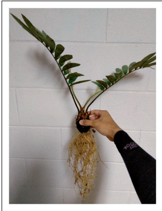
Figure 2. Zamia furfuracea stem cutting after 8 months of growth.

survivability that is achievable when propagating cycad plants asexually. Regardless of treatment, a mean of 96% of stem cuttings produced healthy adventitious root systems and leaves by the end of both studies (Figure 2). Successful asexual propagation of cycads is possible when hygienic conditions are adhered to, stem cuttings are obtained from healthy plants (Marler, 2018), a fungicide mixture such as flowers of sulfur and Bordeaux is applied to the cut surfaces (Tang, 1985), a sealant is used to cover cut surfaces to prevent desiccation (Marler et al., 2020), the medium demonstrates adequate aeration and drainage capacity, and underwatering is used during the propagation phase (Whitelock, 2002).