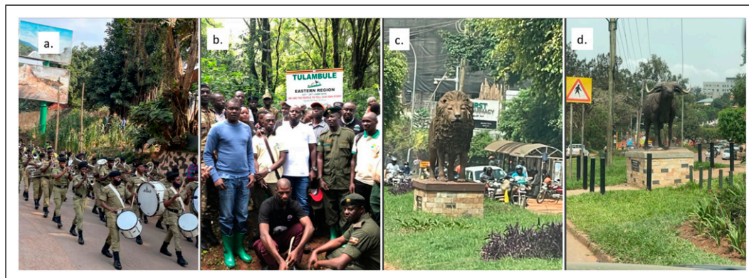
Figure 3. Examples of awareness initiatives (a) parades held semi-annually in the capital city, Kampala; (b) the “Tulambule” media tour; (c) statue of lion in the streets of Kampala; (d) statue of buffalo in the streets of Kampala.