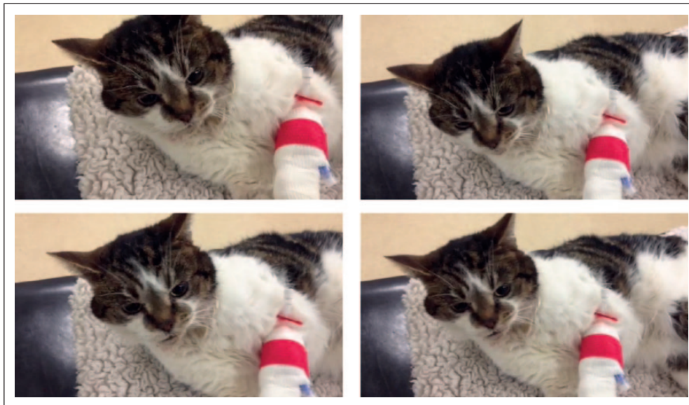
Figure 2 Focal seizure demonstrating the cat's facial twitching (see also Video 1 in the Supplementary material)

marked head pressing, persisted but did not deteriorate further over the following 24 h. The respiratory rate increased overnight and respiratory effort had markedly increased. Therefore, an exploratory laparotomy was performed to address the chronic diaphragmatic rupture on the second day following admission. It was suspected that the clinical signs of the cat were due to hepatic encephalopathy (HE) from multiple acquired portosystemic shunts (MAPSS) secondary to portal hypertension.