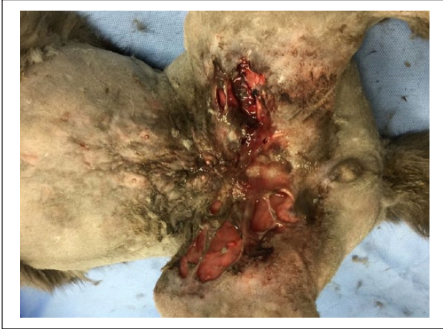
Figure 1 Inguinal region at time of hospitalization (October 2015) and prior to wound debridement

to the Veterinary Medical Teaching Hospital (VMTH) for wound care due to progression of lesions. On physical examination, the cat was alert and responsive and in good body condition (score 5/9) with normal vital signs. The cat was non-ambulatory and assessed to be painful in the pelvic limbs. Within the inguinal region there were deep skin wounds that were 25 cm × 15 cm. A large amount of purulent exudate discharged from the wounds. An ulcerated, 10 cm × 5 cm lesion with exudate and crusts was present on the lateral aspect of the right thigh.