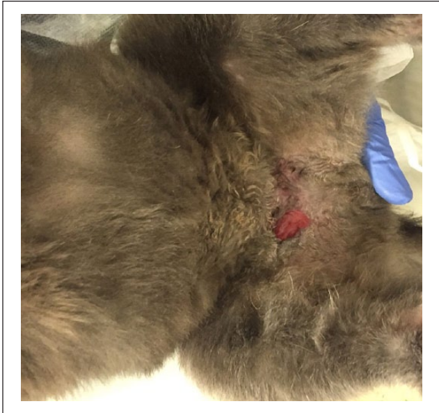
Figure 6 Inguinal area 3 months after hospitalization (January 2016)

changes in both the inguinal area and the right lateral thigh every 2–3 days. Thirty days after admission, the wounds were closed in a staged manner involving two separate surgeries spaced 2 weeks apart. After hospitalization for 50 days, vancomycin was discontinued and the cat was discharged on oral pradofloxacin.