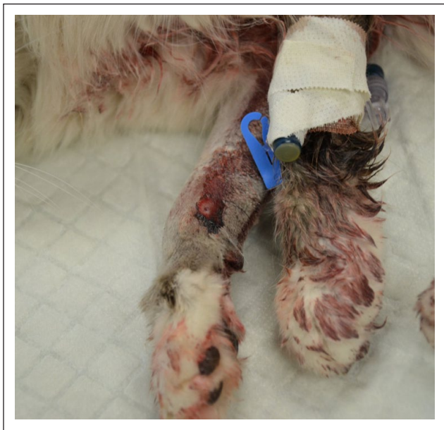
Figure 1 Puncture wound on the right antebrachium of a cat with active hemorrhage due to persistent pit viper envenomation