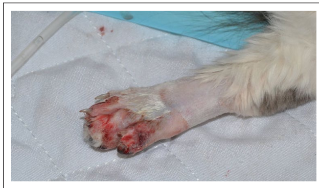
Figure 2 Puncture wound on the fifth digit of the left pelvic limb of a cat with active hemorrhage due to persistent pit viper envenomation

On physical examination, the cat was obtunded and in lateral recumbency. It had weak femoral pulses, pale oral mucous membranes, sinus tachycardia, tachypnea and hypersalivation. There was active hemorrhage from the puncture wounds and hemorrhage in the surrounding soft tissues on the right antebrachium and the fifth digit