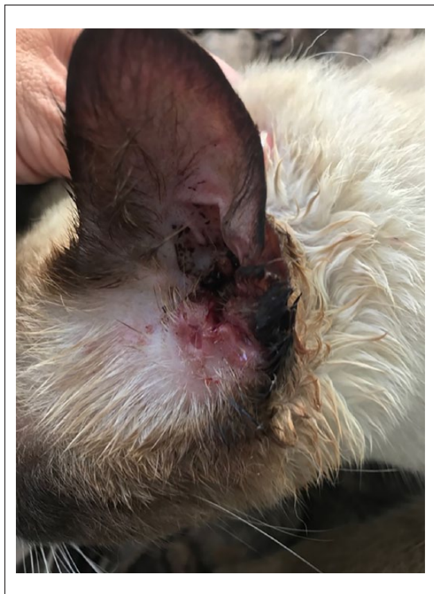
Figure 1 External meatus of the cat with ulceration, erythema and a dark secretion

After the cytopathological examination revealed the presence of yeast-like structures, an oral antifungal