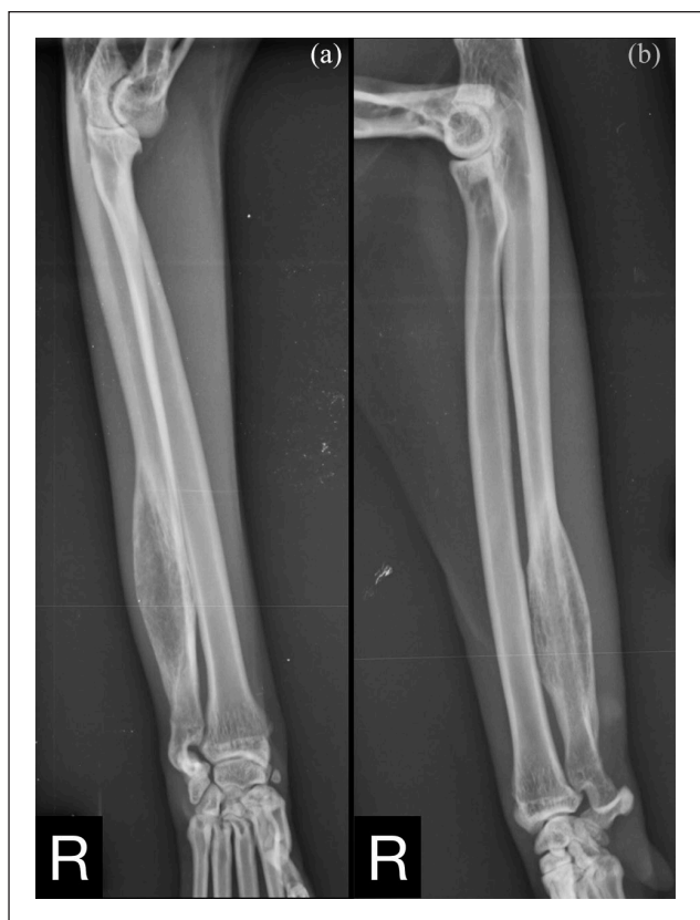
Figure 1 (a) Craniocaudal and (b) mediolateral views of the right antebrachium. A large monostotic lesion is observed on the distal diaphysis of the ulna

thorax was performed. The scan was carried out under general anaesthesia using a four-slice CT scanner (GE LightSpeed; General Electric Healthcare). The patient was positioned in sternal recumbency with the forelimbs extended and parallel to each other. On the CT workstation, images were acquired with soft tissue, pulmonary and bone algorithms, and reformatted in sagittal and dorsal planes. The images were reviewed using a DICOM viewer application (Horos, version 3.3.0; GNU Lesser General Public License) using soft tissue (Window Width [WW]=400, Window Level [WL]=40), pulmonary (WW=1400, WL=-500) and bone windows (WW=1500, WL=300). Adjustments to image window width and level were made as needed.