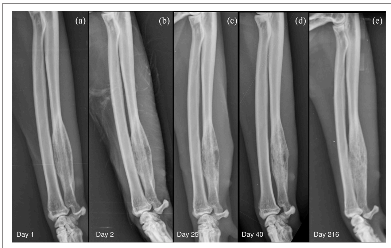
Figure 4 Sequential mediolateral radiographs of the right antebrachium performed at (a) day 1 (day of presentation), (b) day 2 (after bone biopsy), (c) day 25 (5 days after the end of the initial course of antibiotics), (d) day 40 (20 days after the end of the initial course of antibiotics), (e) day 216 (long-term follow-up). The radiograph performed after the bone biopsy (b) shows a defined area of radiolucency in the centre of the lesion representing the bone deficit at the biopsy site. An increasing opacity within the lesion with a less moth-eaten appearance of the medulla, smoothing of the caudal and cranial bony contours and merging of the periosteal new bone with the cortex on follow-up radiography represents bone production as healing takes place (c–e); however, bone remodelling at the long-term follow-up was slower than expected

transition, the periosteal reaction, the cortical response, the rate of change and any extrasosseous extension. 1 However, clinicians should be aware of the low sensitivity and specificity of this imaging modality in the diagnosis of osteomyelitis. 2 In this case, a pattern of geographical lysis associated with a narrow transition zone, solid and lamellated periosteal reaction, thinning and expansion of the cortex were suggestive of a less aggressive, slow-growing lesion. 3