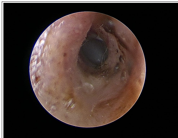
Figure 1 Video-otoscopic image of the right external ear canal showing otitis externa characterized by excessive cerumen and erythema of the canal wall

Treatment consisted only of sarolaner (5mg)/selamectin (30mg) topical solution (Revolution Plus; Zoetis) applied once monthly to the skin of the dorsal