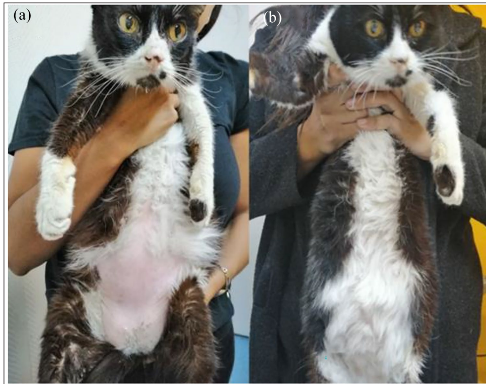
Figure 4 Clinical appearance of the cat, ventral view: (a) at diagnosis of hypoadrenocorticism and (b) at month 3 of cabergoline treatment. After treatment with cabergoline, the abdominal distension was reduced and the alopecic areas were covered with new hair

therapy, for a minimum of 28 days. 9 The cat in this report fulfilled these criteria. Feline diabetic remission was previously described in cats with HAC treated with trans-sphenoidal hypophysectomy, unilateral and bilateral adrenalectomy, pituitary irradiation and also with trilostane. 10–13 In diabetic cats (type 2DM), diabetic remission most often occurs within the first 6 months after the diagnosis of DM. 14 In our cat, diabetic remission was achieved rapidly: around 30 days after insulin therapy and, surprisingly, 3 days after cabergoline treatment with clinical signs of hypoglycemia. In cases of feline secondary DM, such as in this report, diabetic remission could be achieved once the underlying inducing disease is treated effectively. 13,14 However, it is important to highlight that treatment with cabergoline was only associated with diabetic remission and that it is possible that the diabetic remission occurred independent of the treatment with cabergoline.