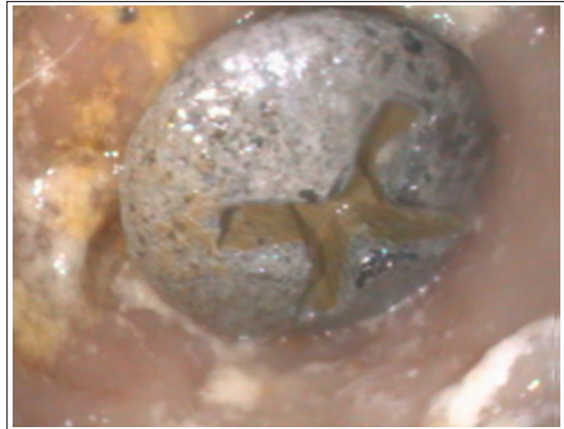
Figure 3 The metal screw nut was identified at the pylorus during endoscopy

neutrophilia of 20.8 \times 10^9/l (RI 2–13). Differential diagnoses for anaemia included haemolysis or haemorrhage. Biochemistry showed moderately increased ALT (249 U/l; RI <60) and ALP activity (277 U/l; RI <50), mild hyperbilirubinemia (10.6 \mu\text{mol/l} ; RI 2.5–3.5) and mild hypercholesterolaemia (6 mmol/l; RI 1.9–3.9). Point-of-care feline leukaemia virus antigen and feline immunodeficiency virus antibody tests were negative. The activated partial thromboplastin time (APTT) was mildly prolonged at 132.0s (RI 65–119) and prothrombin time (PT) was within the RI at 19.0s (RI 15–22). Abdominal ultrasound identified diffuse concentric submucosal thickening of the gastric wall (wall thickness 0.3 cm; Figure 1) and a hypoechoic pancreas with a mild increase in peripancreatic peritoneal echogenicity (Figure 2). Ultrasonographic findings were suggestive of an intramural gastropathy and pancreatitis. Samples were sent for haemotropic mycoplasma PCR ( Mycoplasma haemofelis , Candidatus Mycoplasma haemominutum and