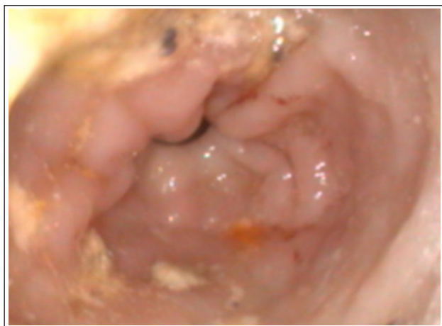
Figure 5 Re-inspection of pyloric region identified a minor erosion

Two days later, PCV was 20% with a total protein of 60 g/l. The cat started eating consistently and the feeding tube was removed after 6 days. Haemotropic mycoplasma PCR, faecal flotation and PCR were negative. The cat was discharged with mirtazapine only and the rest of the medications were discontinued. Body weight at discharge was 2.4 kg. After screw nut removal, metal analysis and serum zinc concentration using leftover serum collected at admission were performed. Serum zinc concentration, available 25 days later, showed a markedly