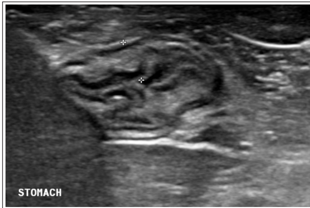
Figure 1 Diffuse concentric submucosal thickening of the gastric wall as shown on abdominal ultrasound