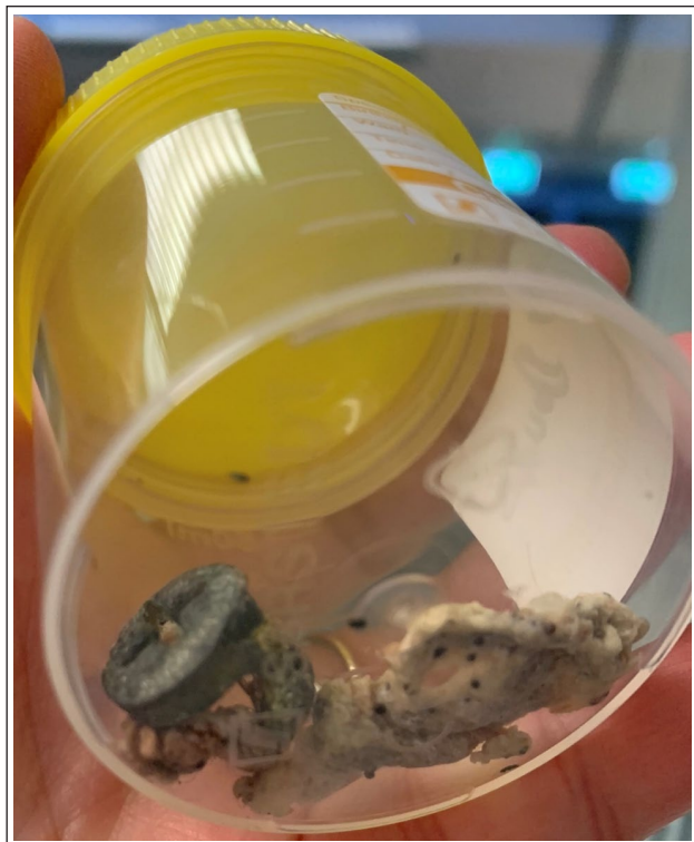
Figure 4 The metal screw nut was removed with a small amount of gastric material (food)