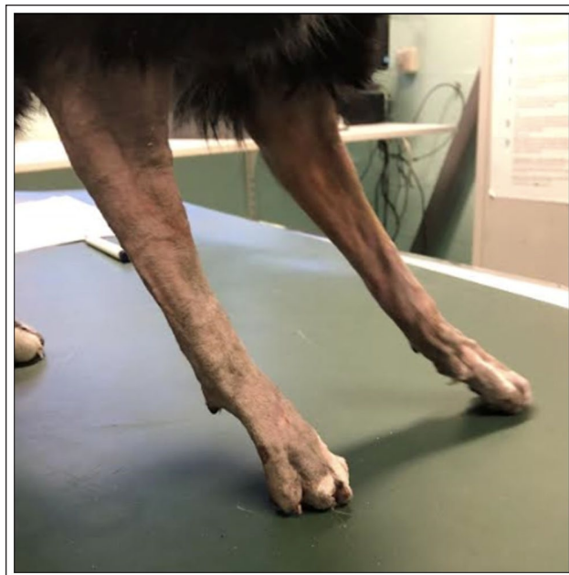
Figure 5 Photograph of a lateral oblique view of both forelimbs of the cat 24 h postoperatively, demonstrating near-complete resolution of the carpal flexural deformity

Follow-up after the second intervention occurred by phone contact. One month after the second intervention, the cat was free of lameness and had no CFD of the forelimbs. The Last follow-up was performed 6 months