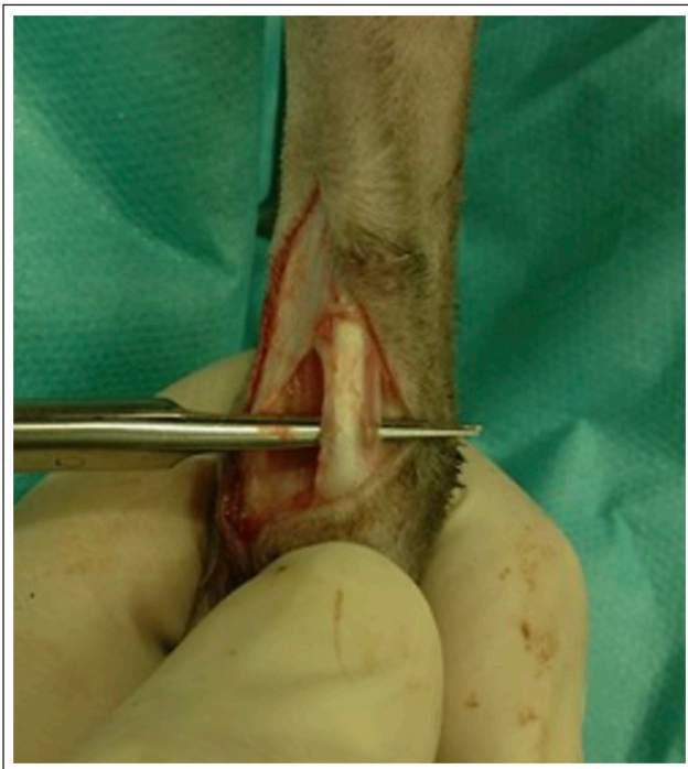
Figure 3 Intraoperative photograph before a tenectomy of the flexor carpi ulnaris muscle tendon of the right forelimb was performed. A palmaromedial to palmarolateral approach was used just proximal to the antebrachio-carpal joint. The tendon of the flexor carpi ulnaris muscle is highlighted with the surgical instrument

biopsies of all sectioned tendons and associated muscles were taken intraoperatively. The subcutaneous tissues were closed using a simple continuous pattern with a 4-0 poliglecaprone 25 suture (Monocryl; Ethicon). The skin was apposed with an interrupted suture pattern with 4-0 polyamide (Ethilon II; Ethicon).