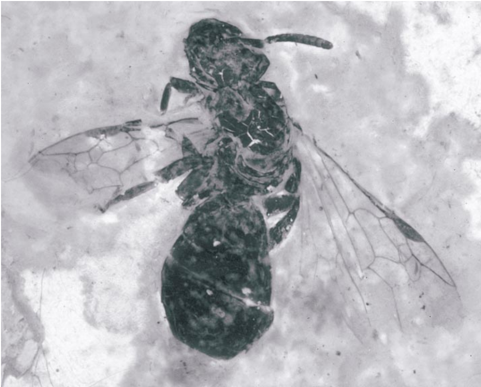
Fig. 2. Photomicrograph of holotype of Halictus petrefactus , new species (MPZ-98/423). Total length of specimen = 8.2 mm.

times vein width (i.e., 1m-cu and 2m-cu [recurrent veins] enter separate submarginal cells); 2rs-m arcuate; pterostigma elongate, length about three times width, border inside marginal cell convex; apex of marginal cell acute, minutely separated from wing margin; first submarginal cell elongate, nearly as long as combined lengths of second and third submarginal cells; second submarginal cell shorter than third submarginal cell, trapezoidal shape, posterior and anterior borders not parallel, posterior border diverging apically toward 1m-cu, anterior border slightly shorter than that of anterior border of third submarginal cell; third submarginal cell with posterior border nearly 1.5 times length of anterior border. Hind wing as depicted in figure 3; only a few hamuli observable (three just distad separation of R, two near termination of costa). Wing veins black, membrane hyaline. Legs black except tarsi (where preserved and evident) apparently dark brown; metafemoral scopa present (setae