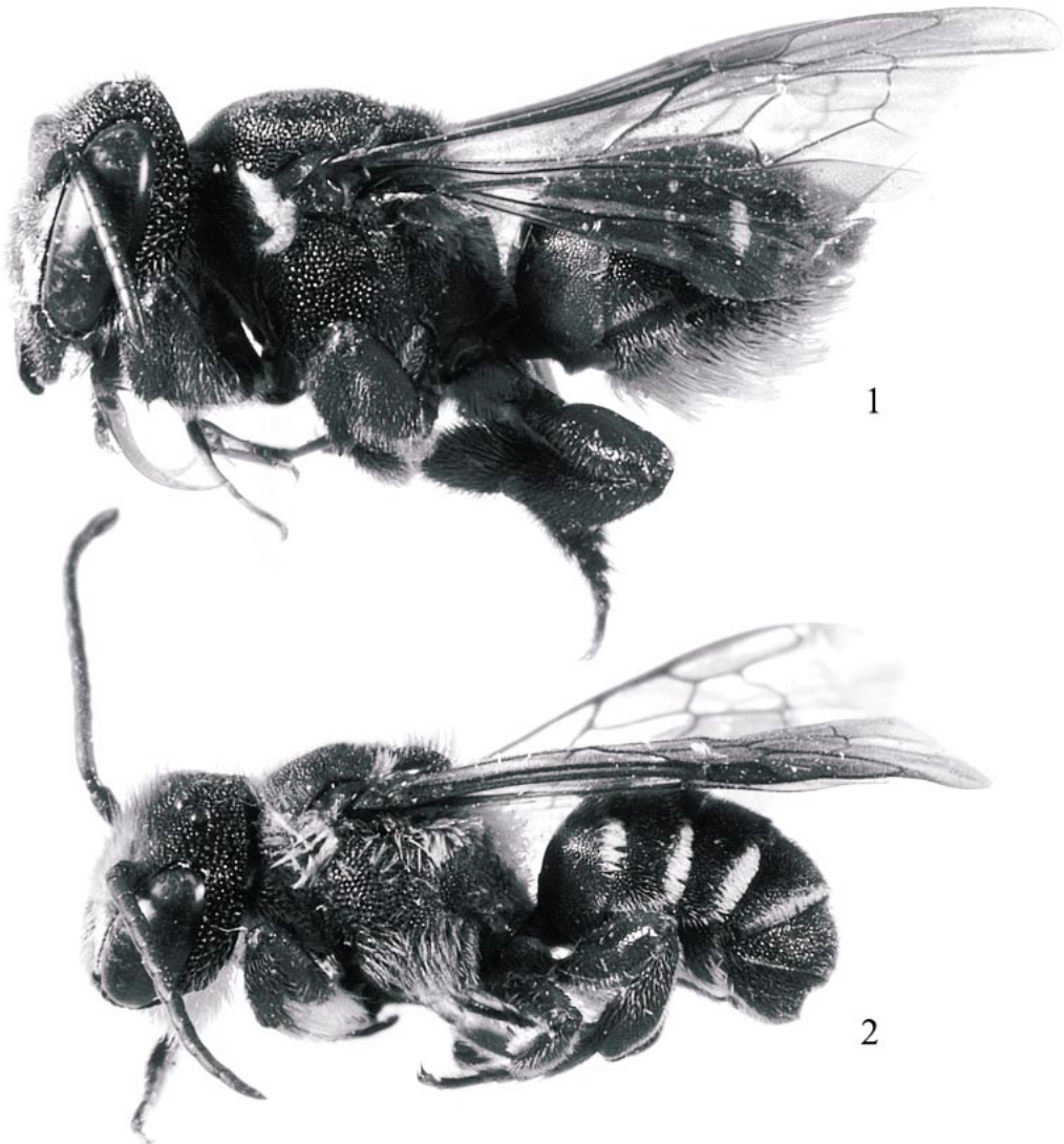
Figs. 1–2. Photomicrographs of Megachile (Matangapis) alticola Cameron. 1. Female, lateral habitus. 2. Male, lateral habitus.

scutellum): width (between tegulae) ratio 1: 0.96. Pretarsal ungues cleft and arolium present on all legs; procoxa unmodified, mutic, anterior surface without cluster of rufescent setae, simply, uniformly pubescent; profemur, protibia, and protarsus unmodified; protarsus slender, with short, even, anterior fringe and longer, irregular posterior fringe; probasitarsus parallel-sided, about three times as long as broad; speculi absent. Mid-legs unmodified, mesotibial calcar present; mesotarsal fringes as described for forelegs.