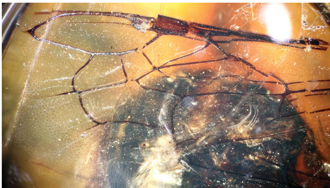
FIGURE 4. Apical forewing venation of fragmentary female of Anthophorula ( Anthophorula ) persephone Engel, new species (AMNH DR-KL1); note that fracturing in wing as preserved distorts some proportions (holotype is preserved completely [fig. 1], but detailed images of the venation appear dark and without contrast against the darkened metasoma immediately beneath it).

such punctures slightly more defined along lateral margins, integument between finely imbricate and shining.