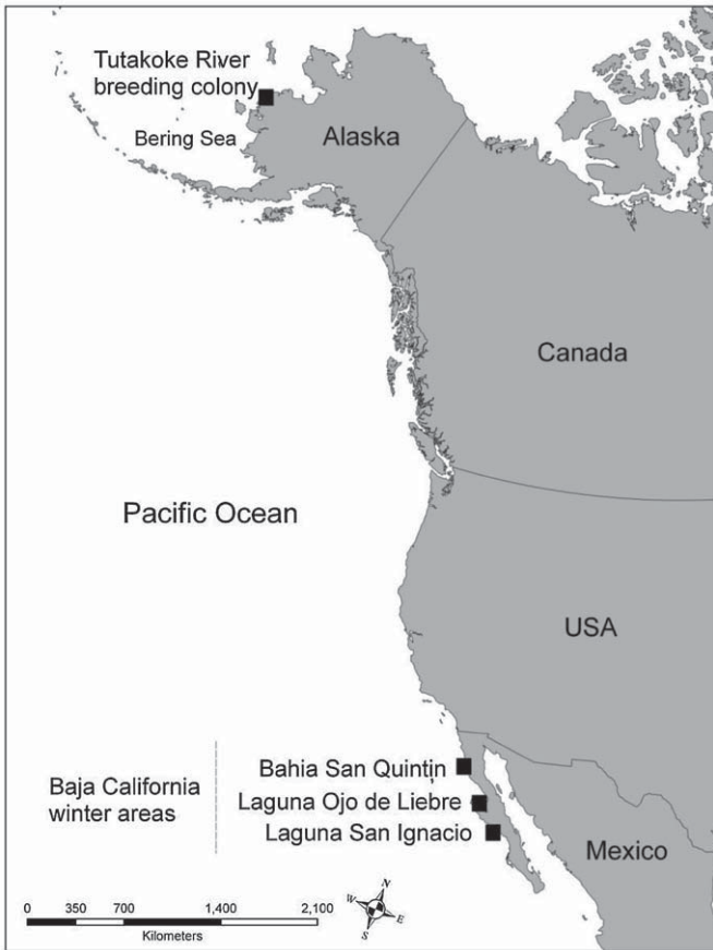
FIG. 1. Locations of the Tutakoke River Black Brant breeding colony in Alaska and three wintering locations in Baja California, Mexico.