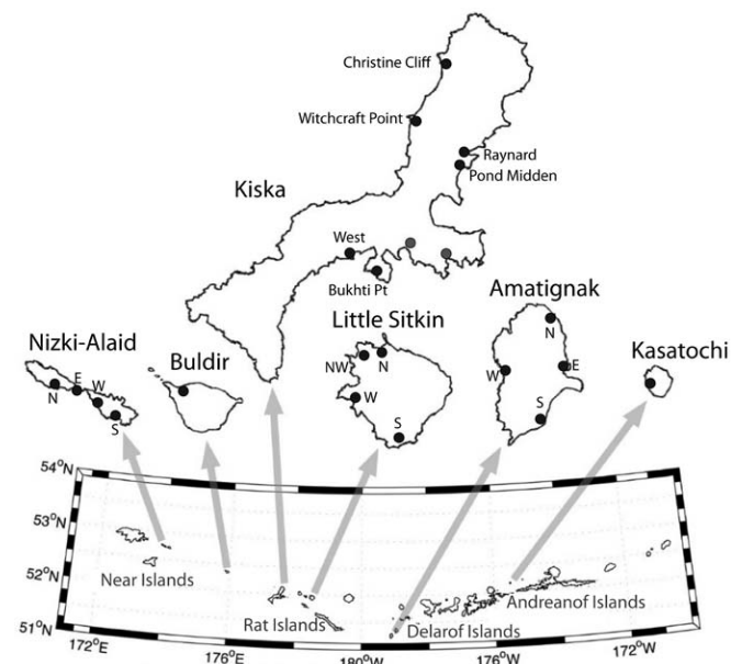
FIG. 1. Distribution of automated acoustic recording devices placed across the western Aleutian Islands during 2008–2010 to record nocturnal vocalizations of seabirds. Acoustic device (song meter) locations are indicated by black dots. Gray dots on Kiska indicate song meters that were placed but malfunctioned.

Study sites. —We deployed 16 acoustic recorders across six western Aleutian Islands: three islands in 2008 (Amatignak, Little Sitkin, and Buldir), five in 2009 (Amatignak, Nizki-Alaid, Kasatochi, Kiska, and Buldir), and one in 2010 (Kiska; Fig. 1 and Table 1). Recording sites on each island had typical Aleutian habitat: treeless,