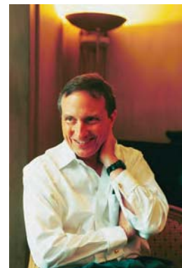
A candid moment with Thomas Lovejoy.