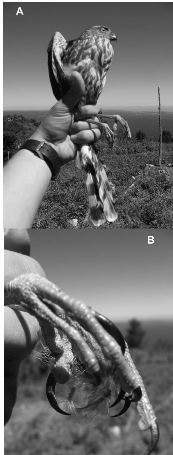
FIGURE 1. (A) A hatch-year Sharp-shinned Hawk captured at Capilla Peak in the Manzano Mountains, New Mexico, with distended crop, indicating recent prey capture and consumption. (B) Close-up of feet of the same bird, showing feathers of prey stuck to toes and talons.

Other researchers sampled potential avian prey in the area at two sites, one near the raptor-banding site at Capilla Peak (DeLong et al. 2005) and the other 35 km north of Capilla Peak in the foothills of the Manzanita Mountains near Coyote Springs. The mist-netting site at Capilla Peak was ~1 km from the primary raptor-banding site along the same ridge complex used by migrating raptors. Migrating raptors frequently passed through the netting area, hunted in the vicinity, and were occasionally captured in the mist nets. The Coyote Springs mist-netting site was in the same mountain range as Capilla Peak, with raptors known to pass through the area before arriving at Capilla Peak. Thus prey sampled