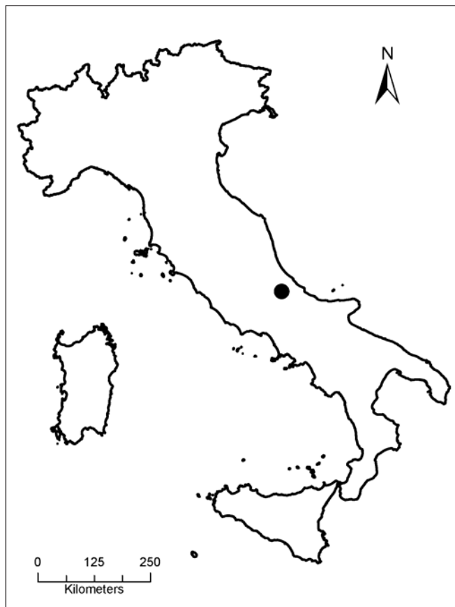
Fig. 4. – Distribution of Crepis magellensis F. Conti & Uzunov.