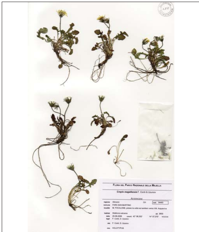
Fig. 2. – Holotype of Crepis magellensis F. Conti & Uzunov. [Conti & Uzunov s.n., APP]

Conservation status. – The species lives only in the alpine belt in the Majella massif in few close localities that can be considered one “location” (IUCN, 2008). The estimated area of occupancy (AOO) is 28 km 2 , the extent of occurrence (EOO) is 3.8 km 2 and we suspect a reduction of the habitat surface caused by ‘tourism’ (threat 6.1 ‘Recreational Activities’) and ‘global warming’ (threat 11.1 ‘Habitat Shifting & Alteration’) (IUCN-CMP, 2008; SALAFSKY & al., 2008). Although both the area of occupancy and extent of occurrence are within the thresholds for “Critically Endangered” (CR), it is uncertain if there has been sufficient decline to justify that category.