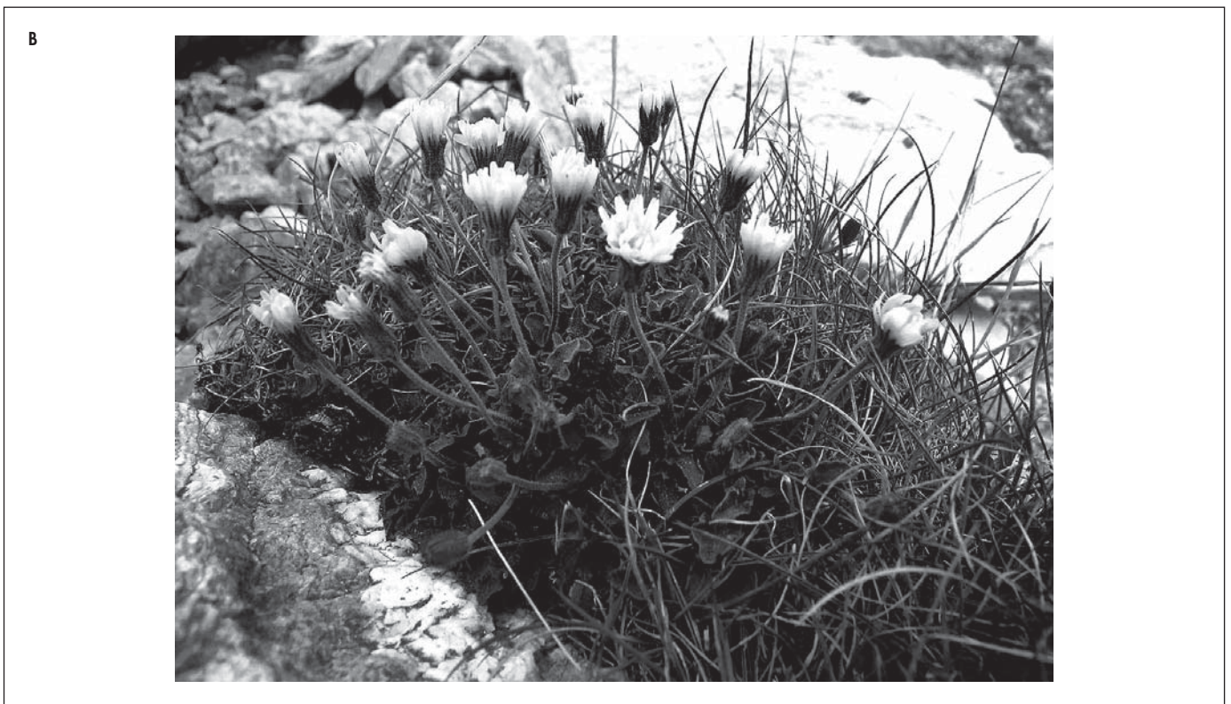
Fig. 3. – In habitat. A. Crepis magellensis F. Conti & Uzunov; B. C. bithynica Boiss.