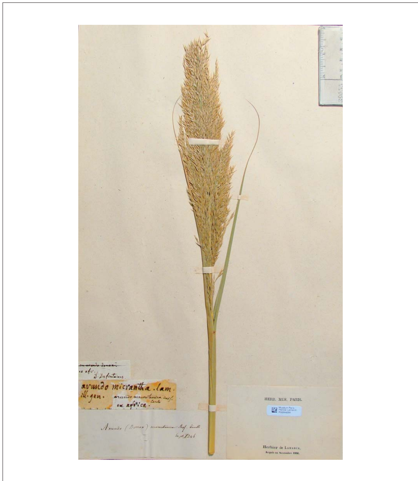
Fig. 1. – Holotypus of Arundo micrantha Lam.

[Desfontaines s.n., P-LA]