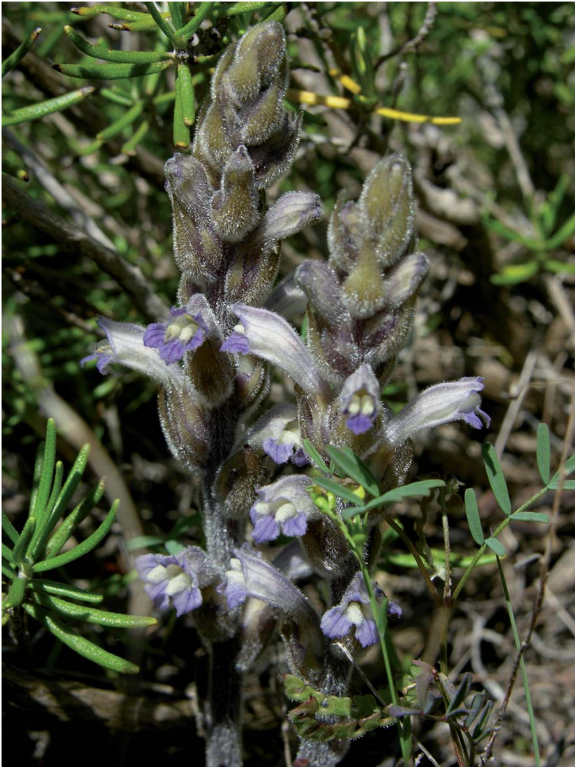
Fig. 2. – Orobanche rumseiana A. Pujadas & P. Fraga.