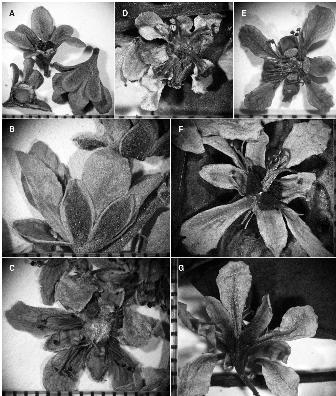
Fig. 2. – Flowers of newly described species of Homalium sect. Eumyriantheia Warb. A. Homalium dorrii Appleg.: flowers and nearly mature fruit with single seed; B. Homalium pseudoboinense Appleg.: abaxial surface of perianth; C. Homalium pseudoboinense : open flower; D. Homalium randrianasoloi Appleg.; E. Homalium ranomafanicum Appleg.; F. Homalium schatzii Appleg.: open flower; G. Homalium schatzii : abaxial surface of perianth.