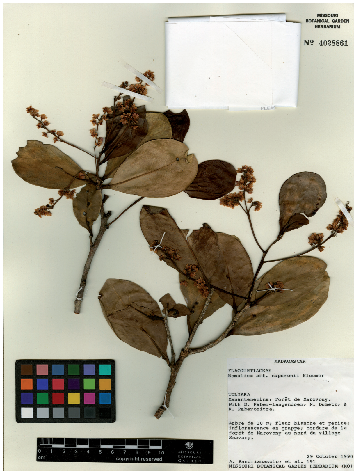
Fig. 4. – Holotype of Homalium randrianasoloi Appleg.

[Randrianasolo et al. 191, MO]