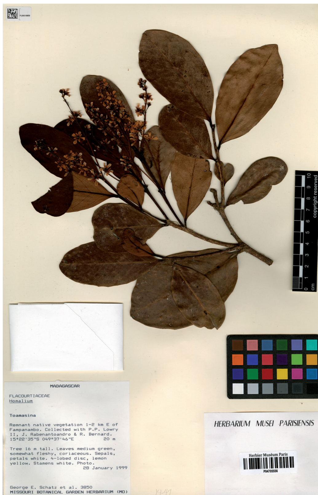
Fig. 6. – Holotype of Homalium schatzii Appleq. [Schatz et al. 3850, P]