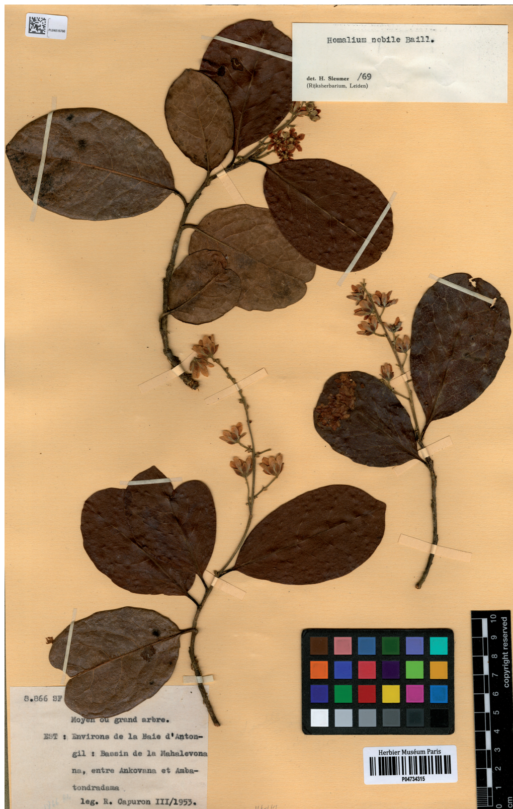
Fig. 3. – Holotype of Homalium pseudoboinense Appleq. [Service Forestier 8866, P]