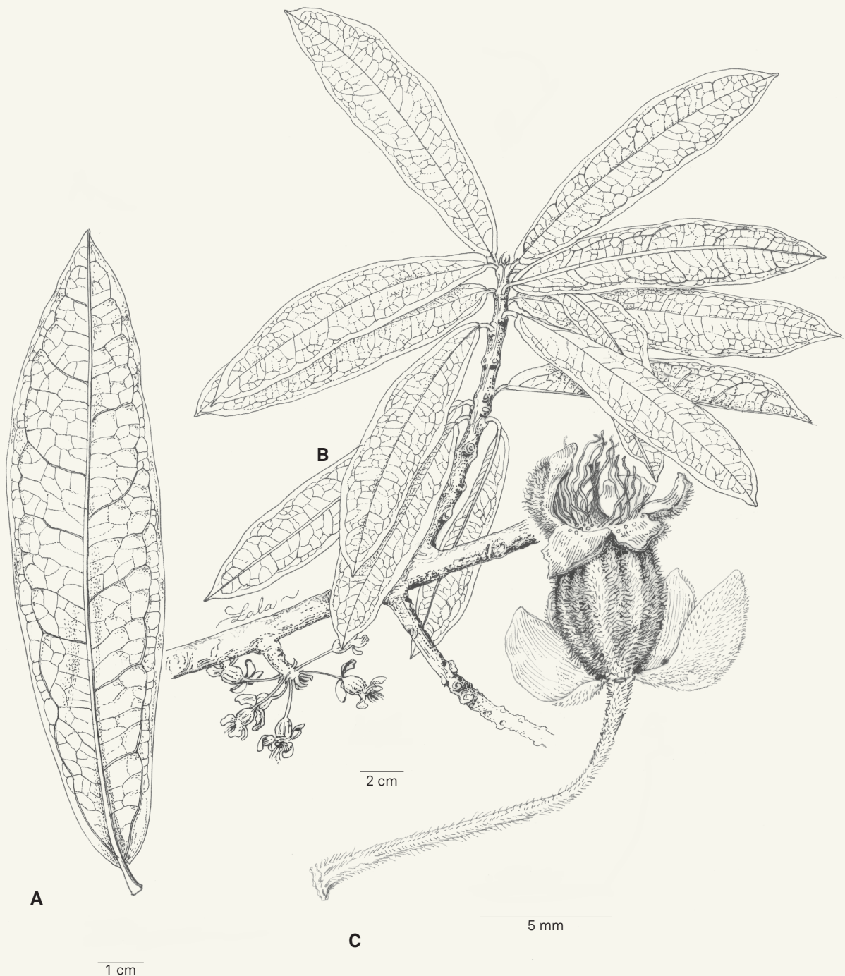
Fig. 2. – Eugenia quadriphylla N. Snow & Callm. A. Abaxial view of leaf; B. Branch and subtending (ramiflorous) inflorescence; C. Detail of flower showing longitudinally ribbed hypanthium, splitting calyx lobes, and four subtending bracteoles. [Bernard et al. 917, MO & TAN] [Drawing: R.L. Andriamiarisoa]