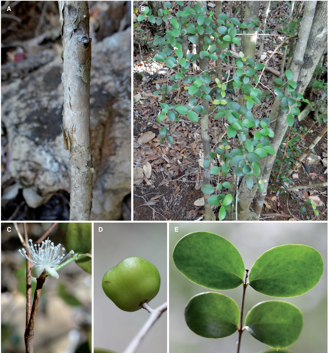
Fig. 1. – Eugenia plurinervis N. Snow, Munzinger & Callm. A. Main stem with peeling grayish bark; B. General habit; C. Flower; D. Immature fruit; E. Radiating secondary nerves of the densely punctate leaves.