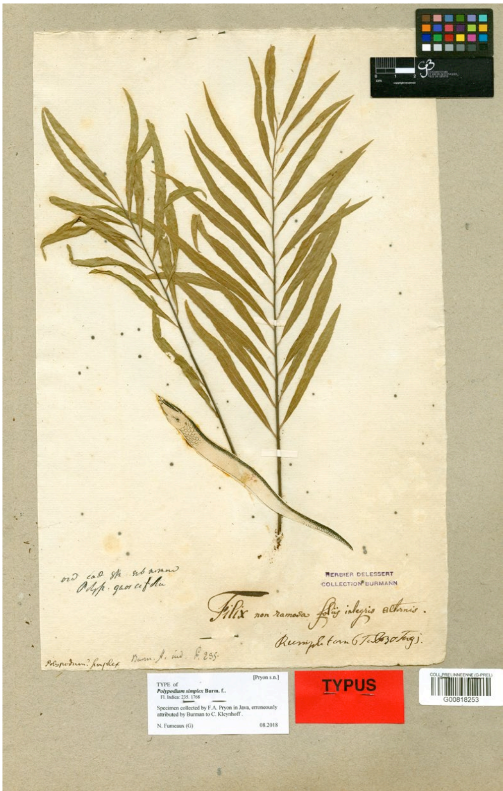
Fig. 7. – Lectotype of Polypodium simplex Burm. f. in G-PREL.