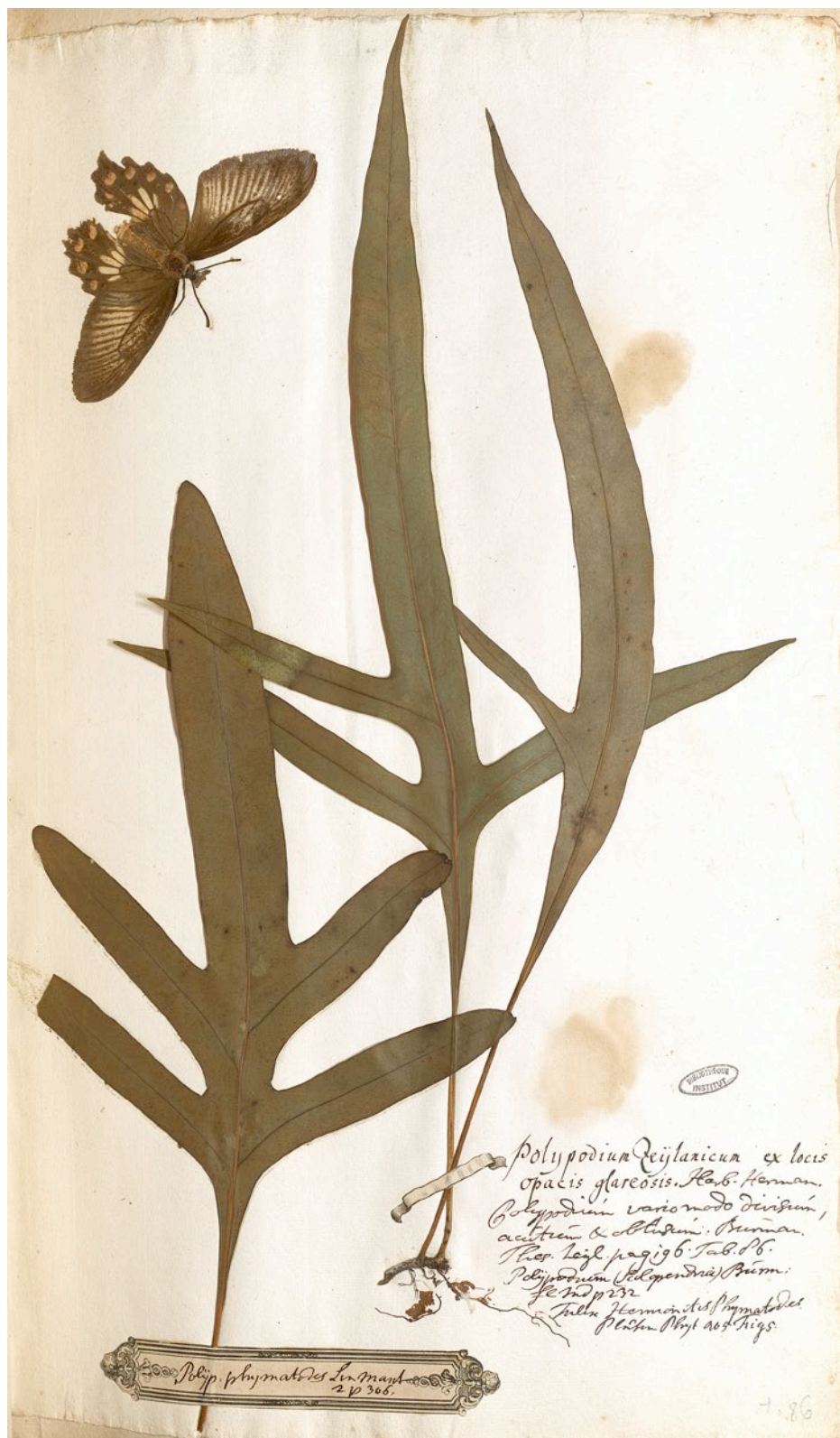
Fig. 6. – Page 41 of Paul Hermann's herbarium from Ceylon in BIF-CEYL with original material of Polypodium scolopendria Burm. f.