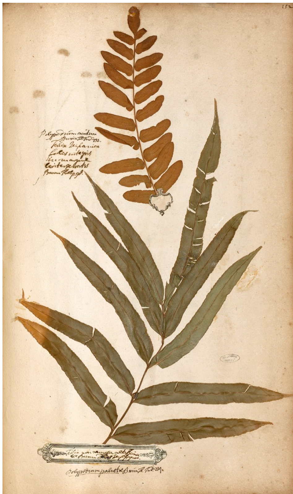
Fig. 3. – Page 152 of Paul Hermann's herbarium from Ceylon in BIF-CEYL with the lectotype of Polypodium acutum Burm. f. (upper specimen) and original material of Polypodium palustre Burm. f. (lower specimen).