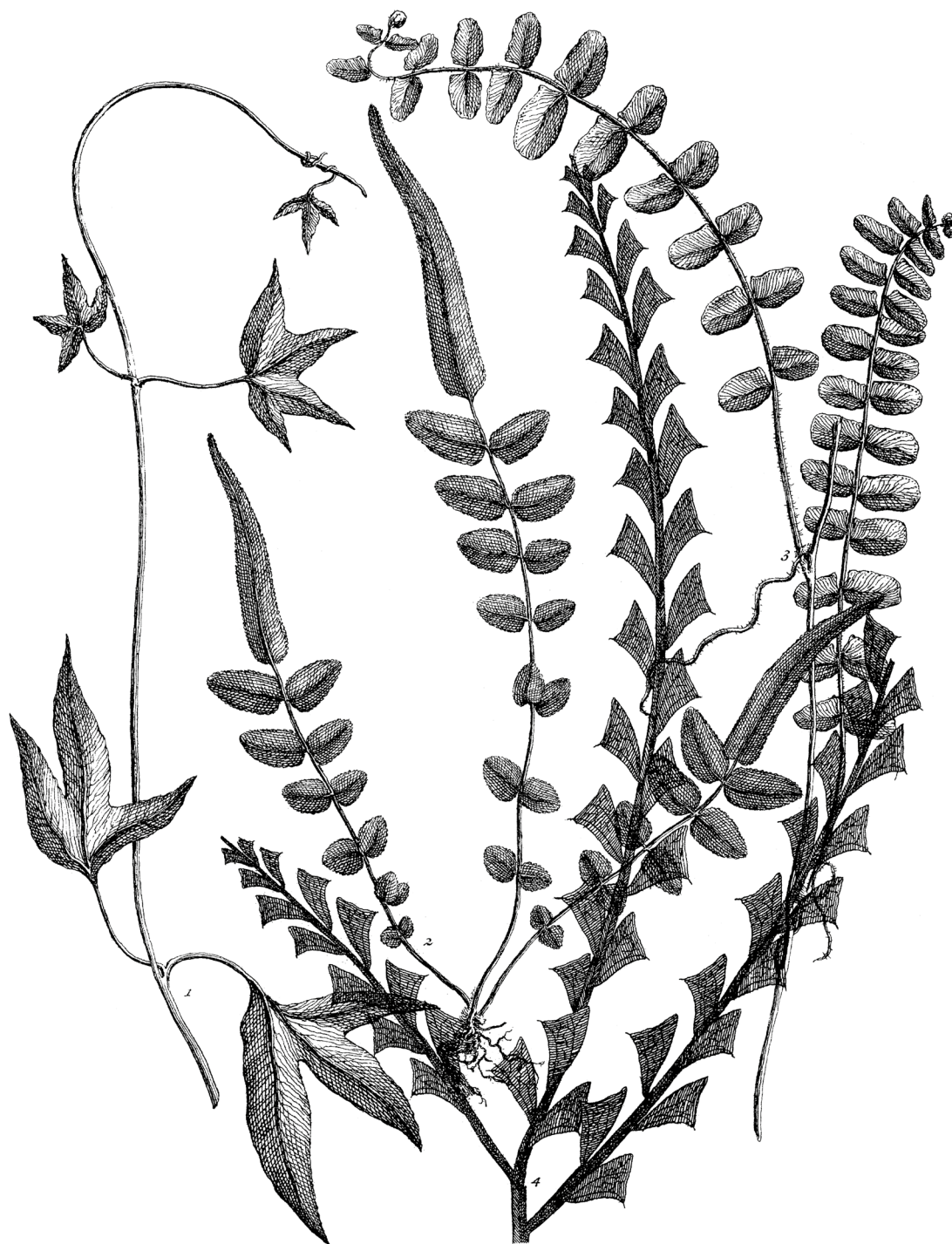
Fig. 1. – Plate 66 of Flora Indica (Burman, 1768) representing Ophioglossum pedatum Burm. f. (fig. 1), Polypodium trapezoides Burm. f. (fig. 2), P. radicans Burm. f. (fig. 3) and Adiantum truncatum Burm. f. (fig. 4).