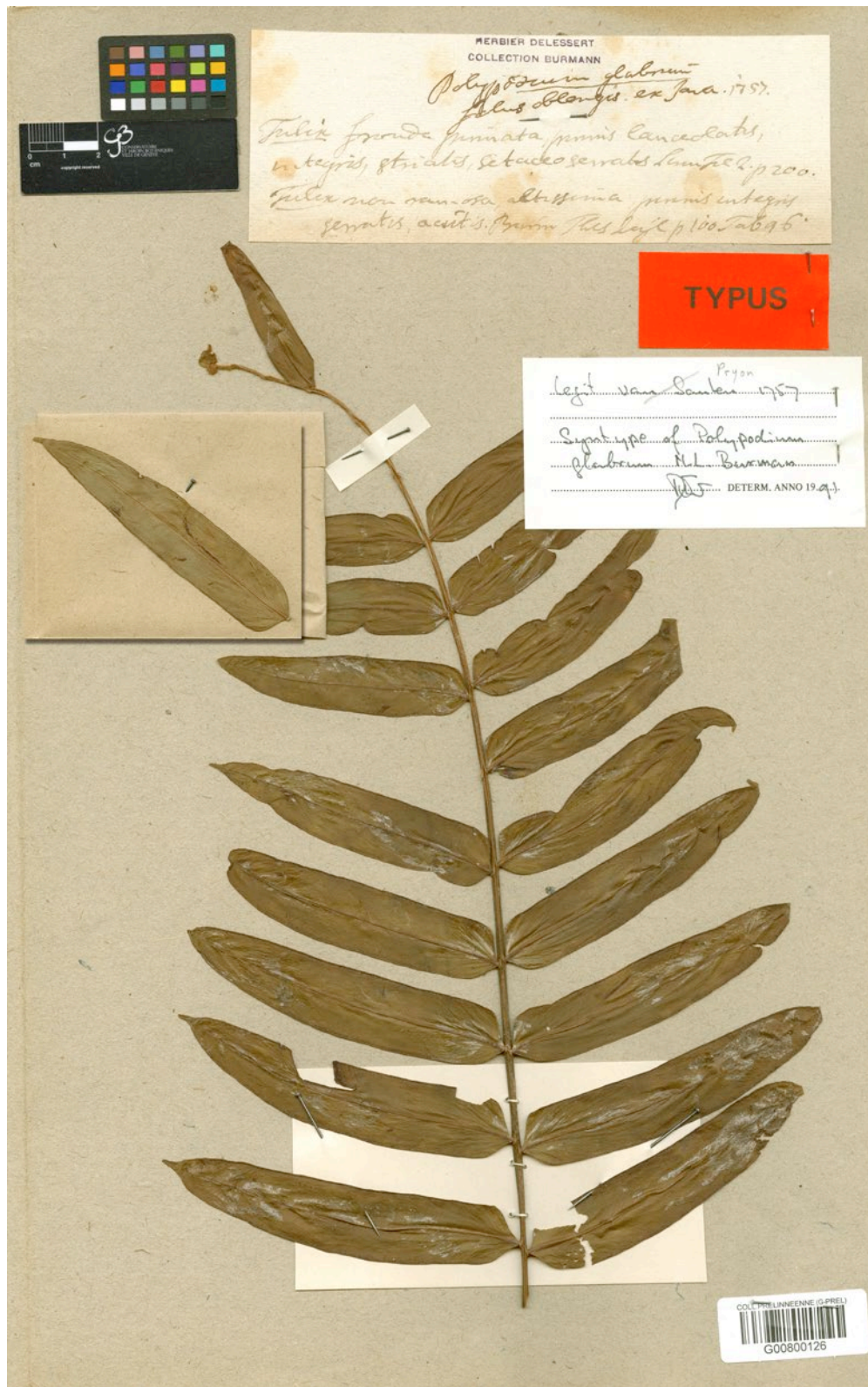
Fig. 5. – Lectotype of Polypodium glabrum Burm. f. in G-PREL.