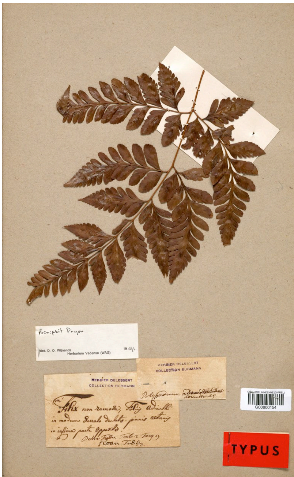
Fig. 4. – Lectotype of Polypodium adiantoides Burm. f. in G-PREL.