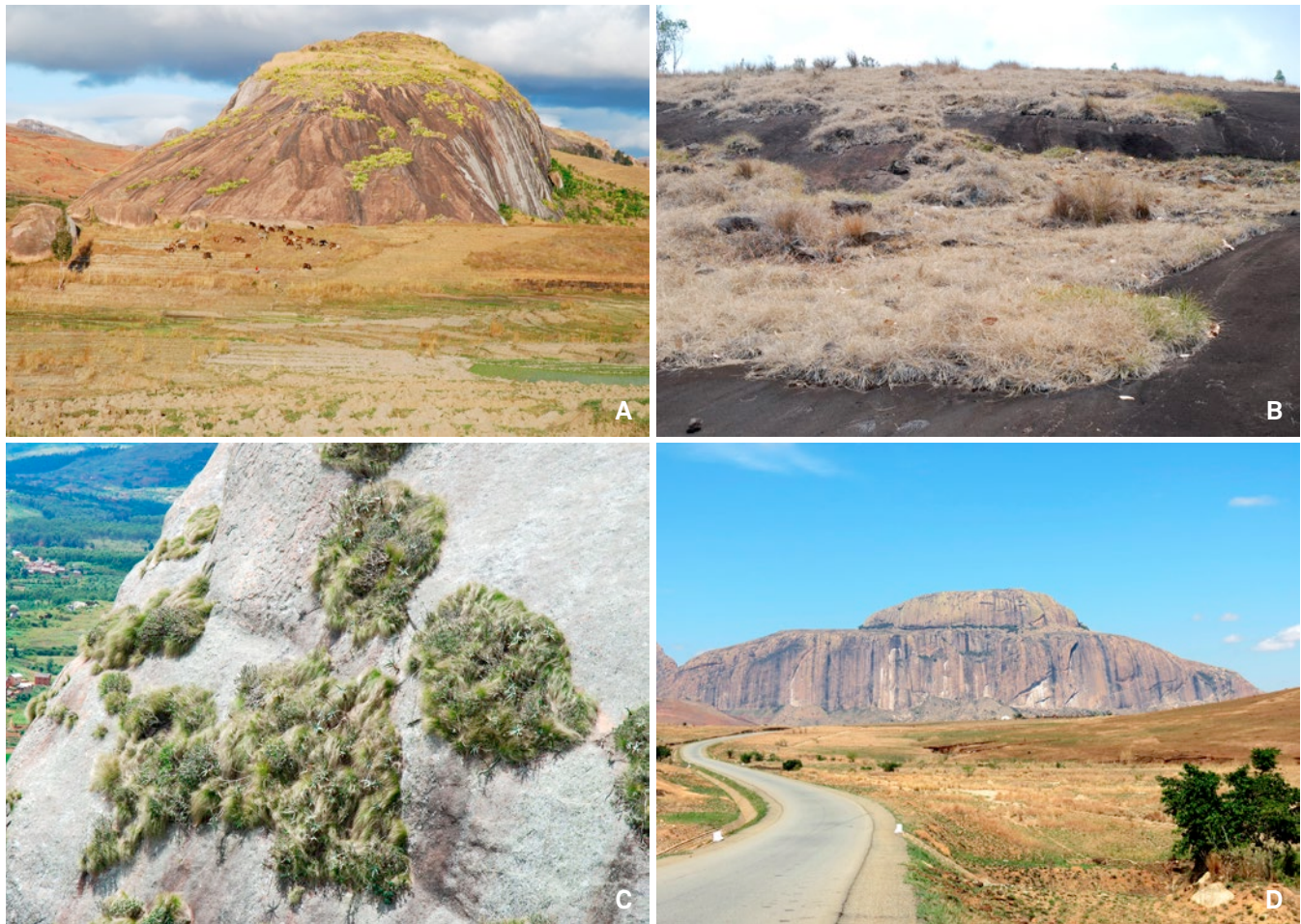
Fig. 6. – A. Inselberg, south of Anja Park (Tangorika) covered with Furcraea foetida (L.) Haw. (Asparagaceae); B. Mat with Styppeiochloa hitchcockii (A. Camus) Cope (Poaceae) near Angavokely; C. Mats formed by Coleochloa setifera (Ridl.) Gilly (Cyperaceae) and steep slopes, south of Fianarantsoa; D. General overview of "Bonnet du Pape, at Voatavo (Fig. 3: n° 26).

exceptions include those within certain National Parks such as Andringitra and Marojejy. In unprotected areas globally, inselbergs often support the last remnants of natural vegetation in a given area. While certain types of human use of inselbergs have occurred for generations and do not seem to have caused severe damage, in recent times human impact appears to have become by far more destructive resulting in steadily growing pressure on these areas, and today most inselbergs in Madagascar exhibit detrimental human impacts. These include: the over-collection of certain useful species which impacts local populations or even threatens local endemics with extinction; use of inselbergs for grazing cattle and goats; uncontrolled bush-fires, usually resulting from the widespread burning of grasslands for agriculture, that may significantly impact the population of individual species and which are also responsible for habitat degradation or destruction as a whole (see WHITMAN et al., 2011 for a study of the influence of fire and water availability