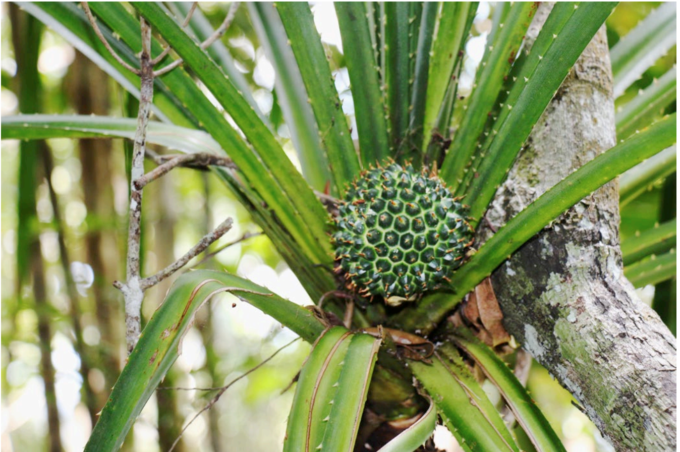
Fig. 3. – Photograph of Pandanus kalobinonensis Callm., Razakamal. & Luino. [Luino & Razakamalala et al. 106]

massifs where Tsimihety immigrants have established settlements for several decades and are practicing slash and burn agriculture (SOLO et al., 2008) (Fig. 1). The loss of moist evergreen forest area between 2006 to 2016 has reached 1408 ha, which represents 15% of the total cover of the PA (RABENANDRASANA et al., 2018). Since mid 2018, slash and burn agriculture is restricted within the strict conservation zone, but the risk of uncontrolled pasture fire is still a threat (P. Ranirison, pers. comm.). With an area of occupancy (AOO) of 4 km 2 , and despite that both collections occur within limits of the protected area, P. kalobinonensis is therefore assigned a preliminary conservation status of “Endangered” [EN Blab(ii,iii,iv,v)+2ab(ii,iii,iv,v)] using IUCN Red List Categories and Criteria (IUCN, 2012).