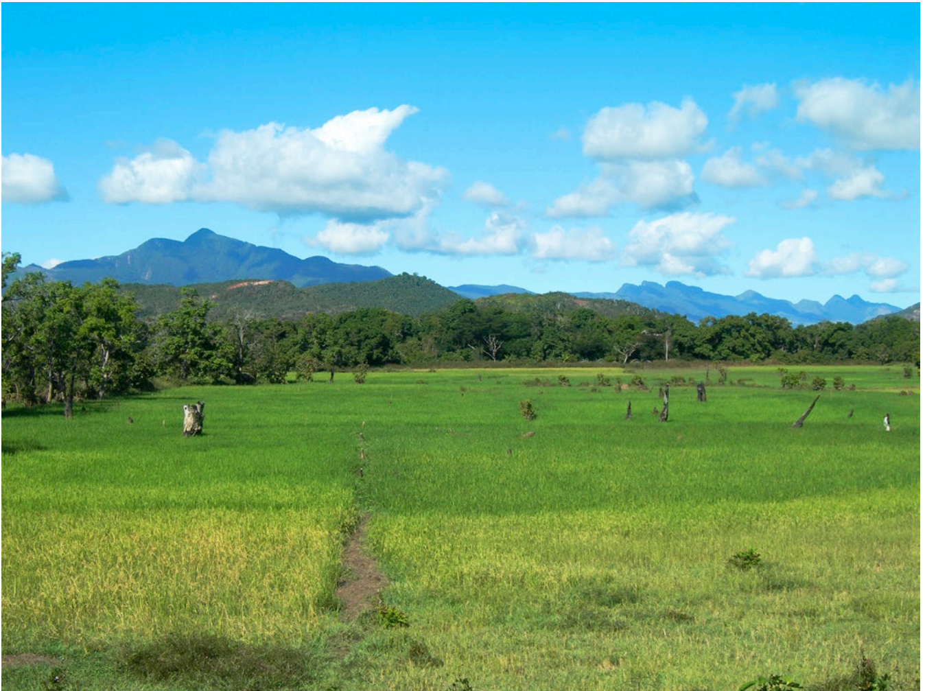
Fig. 1. – The Galoko mountain range with the Galoko summit on the left, the distinctly shaped domes of the Kalobinono on the right and rice plantations in the foothills.

Drupes c. 65–140 per syncarp, (15–)20(–25) mm high, 5–7 mm wide, (3–)4–6 mm thick, 4–6 angled; carpel 1, free in the upper fourth, tapering to the base; pileus pyramidal, somewhat rounded at apex. Stigma 1, erect or curved, spiniform, on the centre of the apical face of the pileus, brown in vivo , 3–5 mm in length, stigmatic groove abaxial, covering c. \frac{2}{3} of the length of the stigma. Endocarp 10–13 mm long in the centre, < 1 mm wide, 4–6 mm away from stigma base; seed locule oblong, 10–12 × 3–5 mm, superior and inferior mesocarp fibrous. Staminate plant unknown.