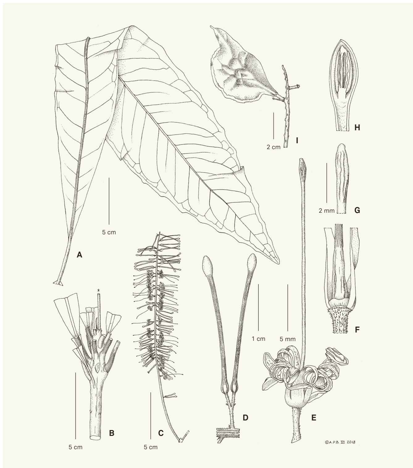
Fig. 1. – Virotia azurea H.C. Hopkins & Pilon. A . Leaf; B . Apex of a shoot showing the arrangement of leaf bases and the base of an inflorescence axis (*); C . Inflorescence (conflorescence), the flowers post-anthesis; D . A flower-pair immediately prior to anthesis, their peduncle subtended by a minute bract and a small bract present at the base of each pedicel; E . A flower post anthesis, the tepals all helically curled; F . Base of a flower, two tepals removed to show the ovary and the cup-like disc around it; G . Apex of the style, slightly swollen and ridged, forming the pollen presenter; H . Distal part of a tepal, inner surface, with the anther attached; I . Immature fruit, note prominent beak. [A, C, E–H: Gâteblé et al. 87, P; B: Munzinger et al. 1462, P; D: MacKee 15159, P; I: MacKee 46274, P] [Drawing: Andrew Brown]