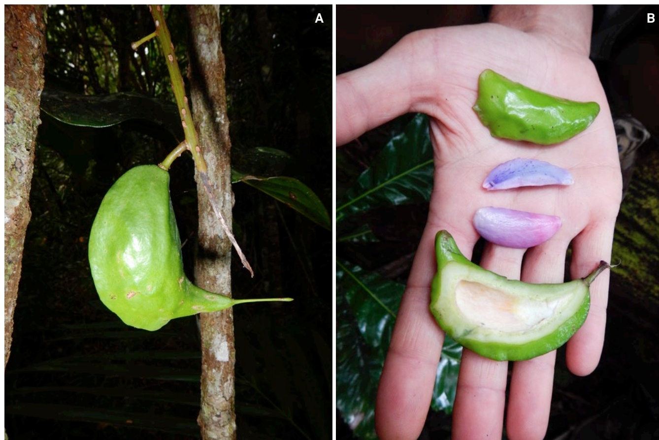
Fig. 3. – Virotia azurea H.C. Hopkins & Pillon. A. Fruit; B. Fruit cut open to reveal the bluish mauve cotyledons.

lobes ovate, thickened, 2.5 \times 1.5 mm, tepal lobes below the tip long and narrow, curling helically, blue to white (including light blue, mid-blue and white-violet), their inner surface glabrous. Stamens : free part of the filament very short, each one inserted towards the base of the ovate tip of a tepal; anthers 2 \times 1 mm, the connective shortly prolonged at the apex. Disc an erect, hypogynous cup or collar, thin, glabrous, slightly undulate along the top margin to shallowly 4-lobed or the lobes sometimes splitting to the base, maximum height 0.4 mm. Gynoecium : ovary cylindrical-conical, 1.5\text{--}2.5 \times 0.8 mm, glabrous or with a few minute hairs, blue or violet; style cylindrical, long and slender, 21\text{--}30 \times 0.5 mm, glabrous, \pm white, the distal 2.5 mm forming a slightly swollen pollen presenter, this glabrous and shiny black with longitudinal ridges when dry; stigma a short terminal slit. Fruit few per infructescence, each borne on a thickened pedicel/peduncle c. 8 mm long, somewhat laterally compressed, crescent shaped or ventral part \pm elliptic in outline with a marked beak at the end of the dorsal margin, c. 7.3 cm long (including the beak 1.5 cm long) \times 3.5 cm deep (between the mid-points of the ventral and dorsal margins); epicarp bright or dark shiny green, glabrous; seed (based on Gâteblé et al. 449) 1 per fruit, almond-shaped,