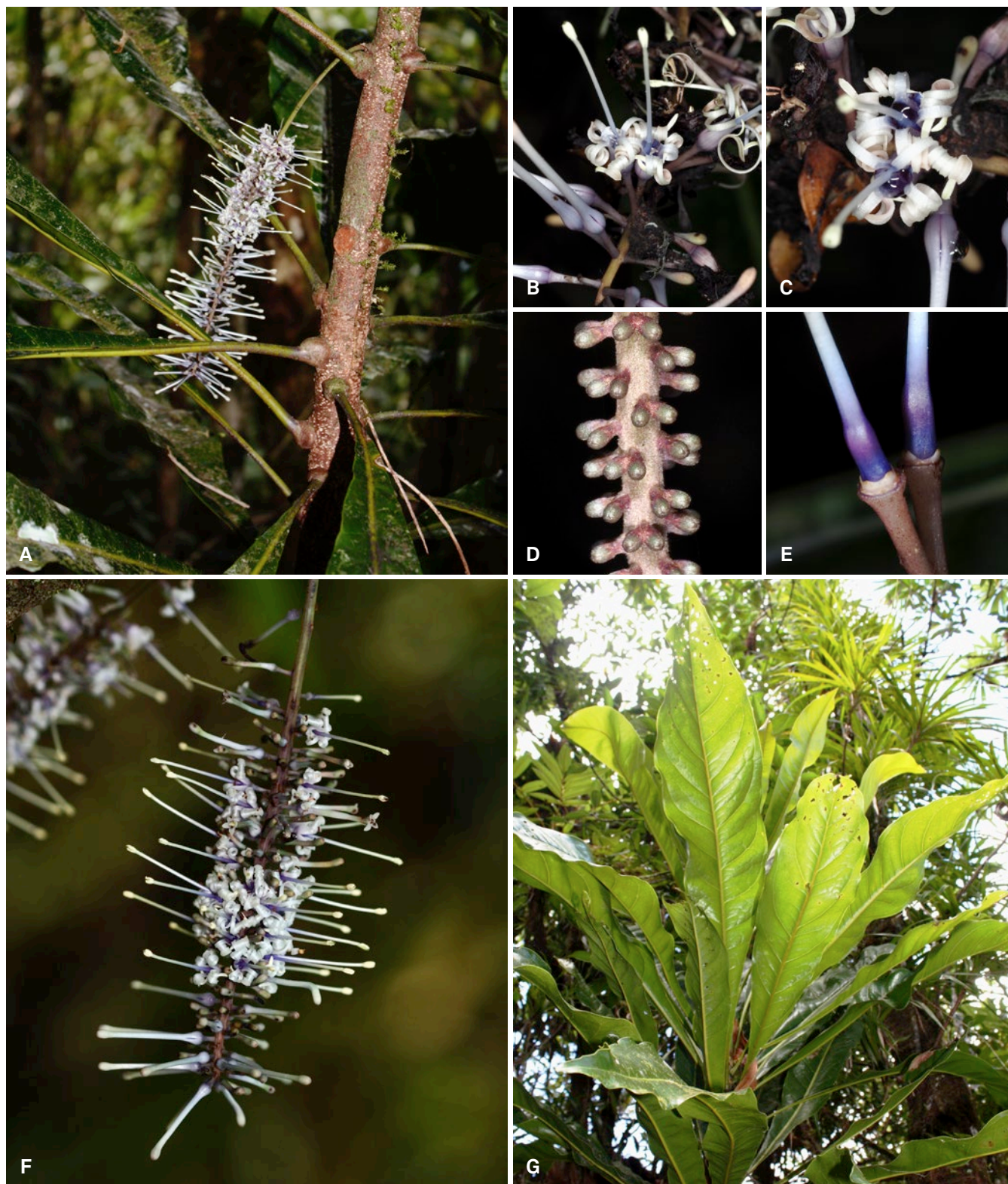
Fig. 2. – Virotia azurea H.C. Hopkins & Pillon. A. Inflorescence arising from a leaf axil; B. A flower-pair at anthesis plus flower buds; C. Pair of flowers (note helically curled tepals and nectar); D. Very young floral buds; E. Two purple ovaries (note disc at base) and white styles; F. Inflorescence; G. Under surface of foliage.