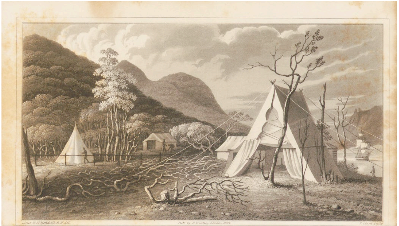
Fig. 2. – Pendulum Station at Port Cook, Staten Island. [WEBSTER, 1834a: 99]

be appointed to serve with the expedition in the character of botanical collector, whose exclusive duty it shall be to procure and preserve botanical specimens and seeds, and whose collections shall from time to time be delivered to the care of the commanding officer, to be transmitted to England as occasion may occur” (WEBSTER, 1834b: 380). And it continued as follows: “That Mr. Webster, the surgeon of the ship, be directed to attend to the collection and preservation of specimens in zoology, mineralogy, and geology united; and the Committee will hold themselves in readiness to furnish to Mr. Webster and to the botanical collector, such further instructions in detail as may be required” (WEBSTER, 1834b: 380–381). The presumed botanical collector is not afterwards mentioned by Webster in his account, which makes one think that Webster himself was who finally held such responsibility. In fact, the botanical specimens originated from this expedition were attributed to him and housed in K. This second statement is not mentioned in Webster’s account but becomes logical knowing the royal nature of the expedition. Moreover, Webster’s specimens are mentioned several times in the later Flora Antartica by Joseph D. Hooker (1817–1911), who developed most of his career in Kew.