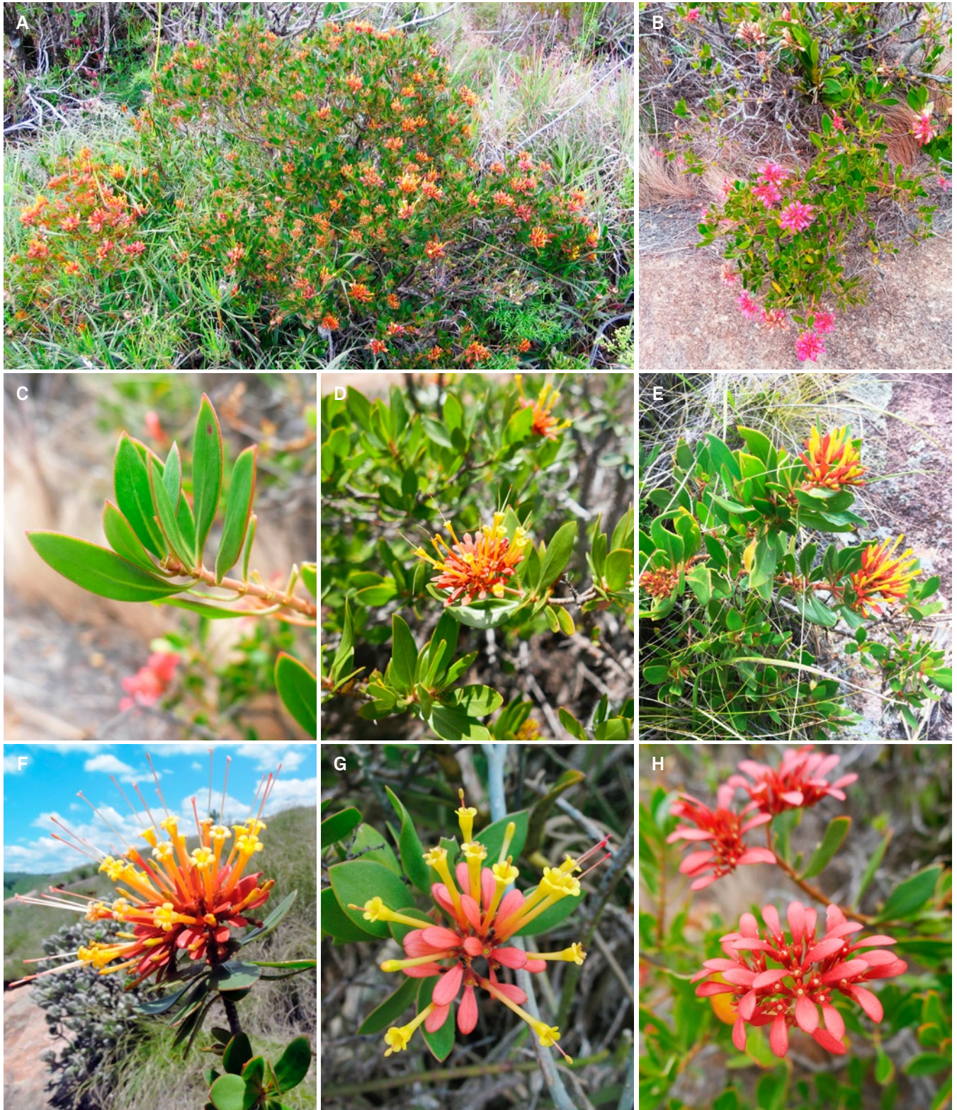
Fig. 4. Nematostylis citriflora Kainul. A, B. Habit and habitat; C. Leaves; D–G. Flowering branches; H. Young fruits.