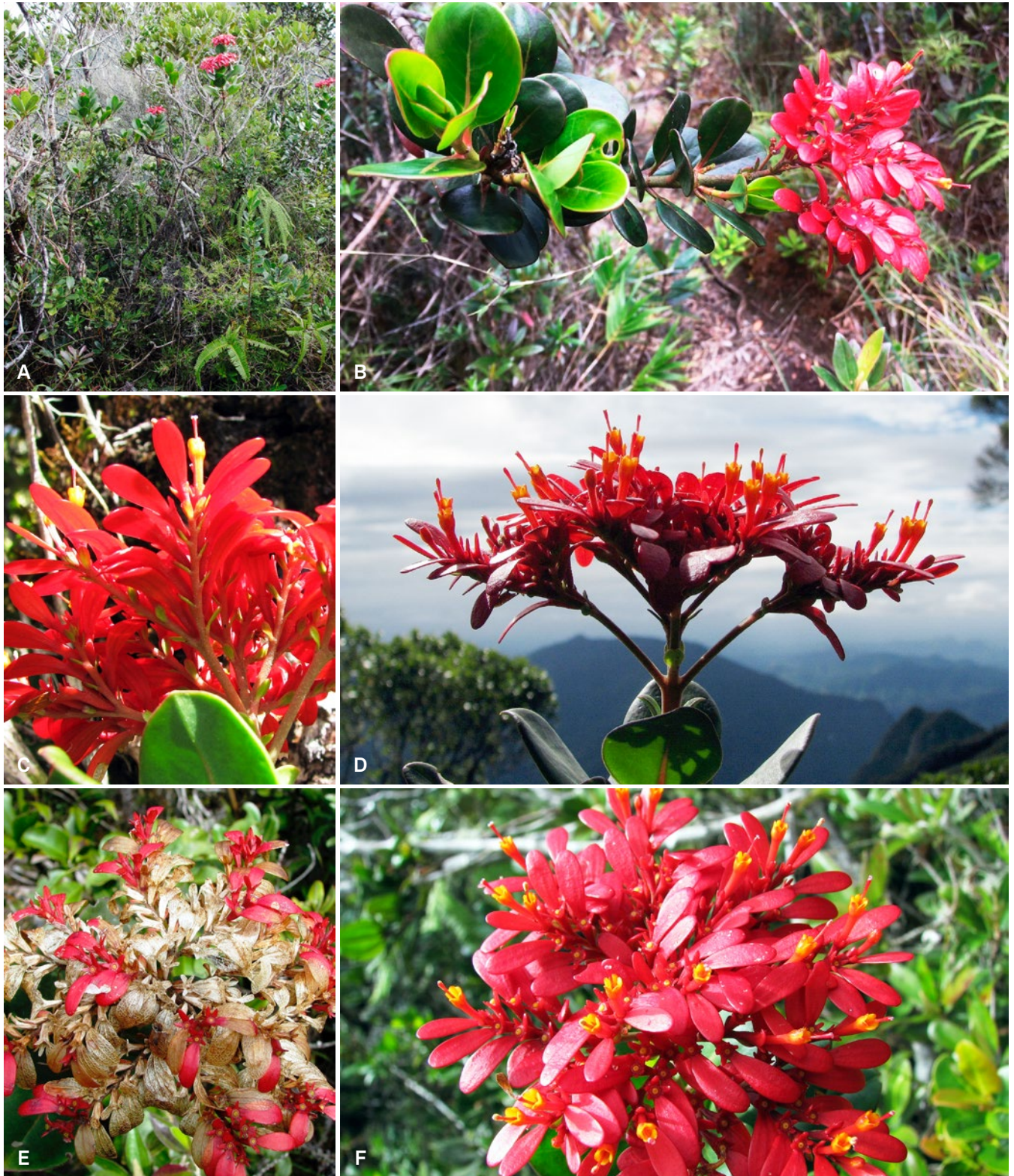
Fig. 5. Nematostylis incarnata Kainul. A. Treelet growing in thicket; B. Flowering branch (note the flush of new leaves with persistent older leaves); C. Bottom-view of an inflorescence, showing leafy bracts; D. Side-view of an inflorescence; E. Infructescence with acropetally maturing fruits (note the now translucent calycophylls); F. Top-view of an inflorescence (note the bright yellow disks of the flowers). [C–F: Bremer et al. 5294]