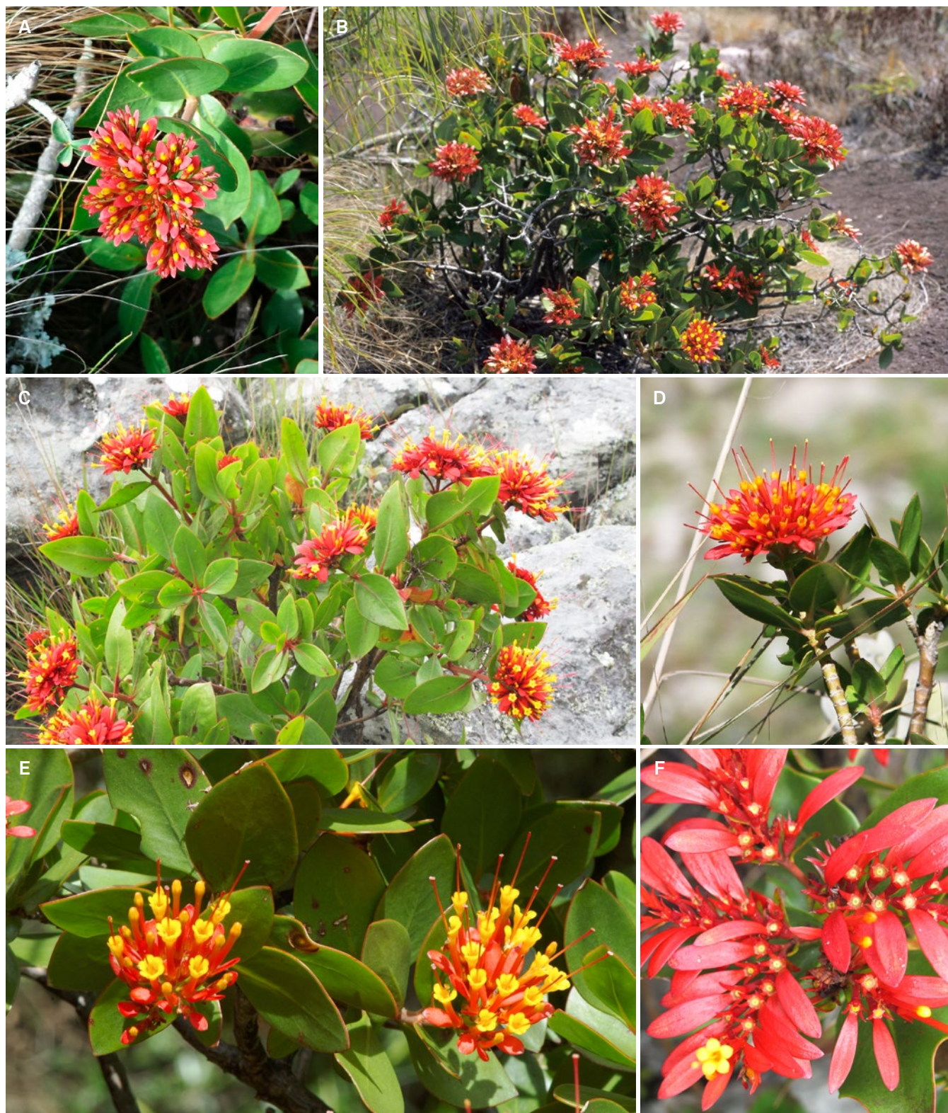
Fig. 3. Nematostylis anthophylla (A. Rich. ex DC.) Baill. A. Flower buds; B, C. Habitat and habit; D, E. Flowering branches; F. Young fruits.