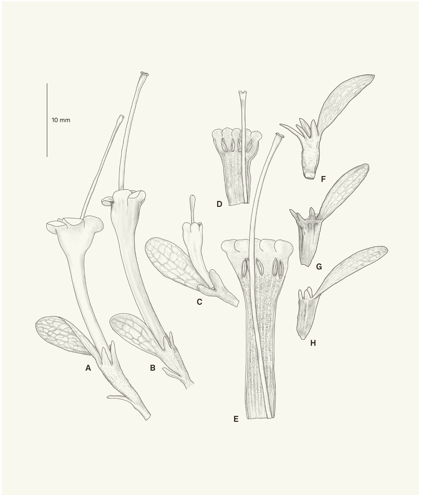
Fig. 2. A–C: Flowers in side-view; D, E: Corolla interior; F–H: Fruits in side-view.