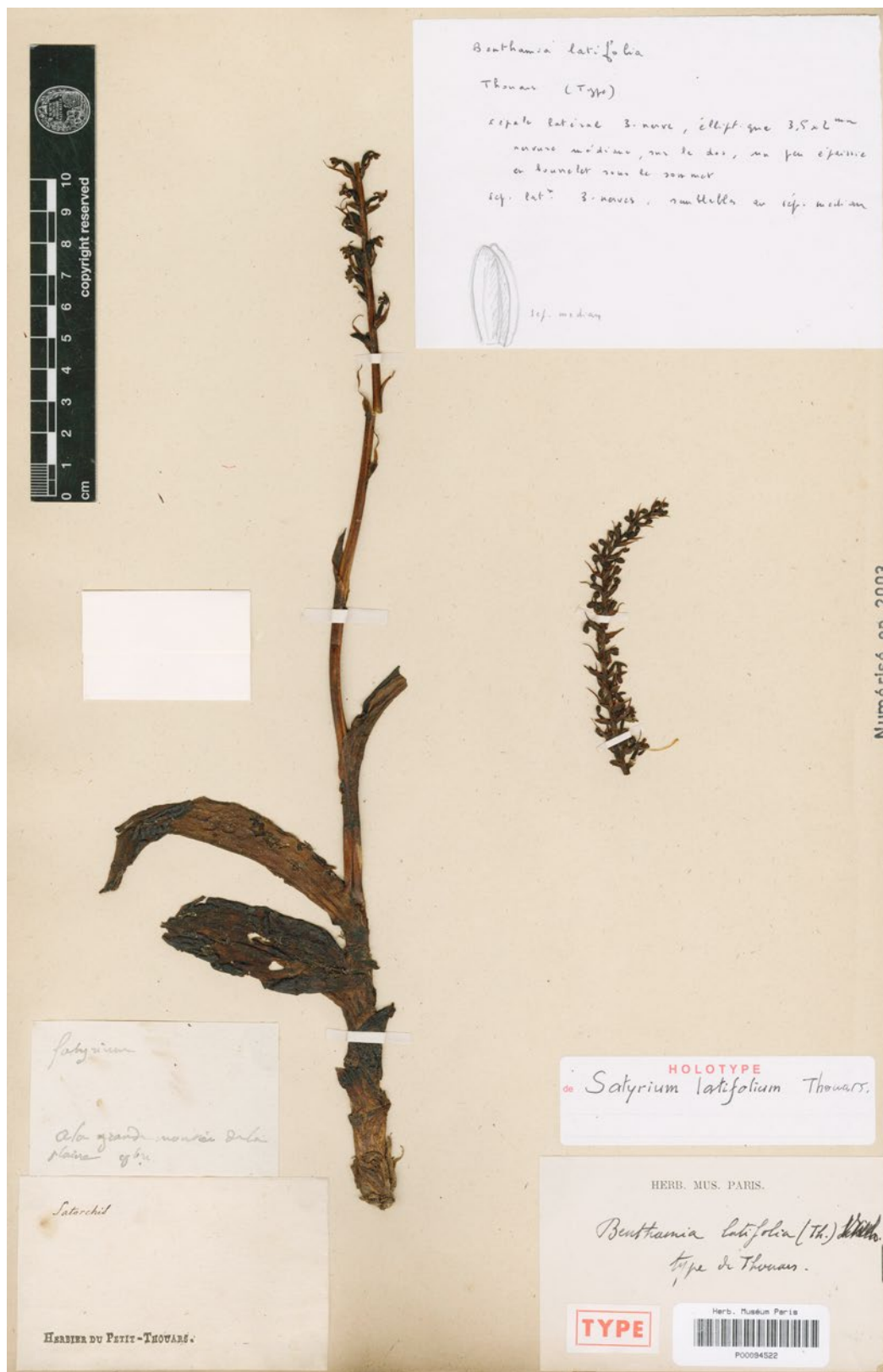
Fig. 1. – First sheet of the lectotype of Satorkis latisatis Thouars in P. [Thouars s.n., P] [P00094522]