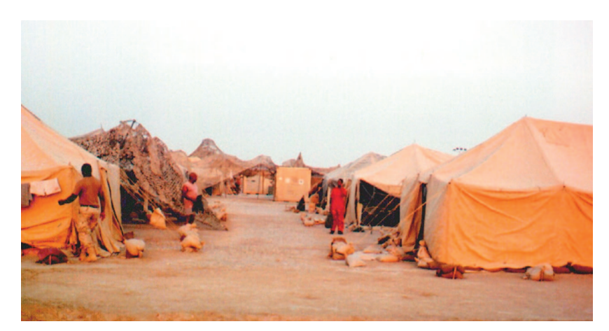
Fig. 4. Tents belonging to a U.S. Army unit stationed at TAB (June 2003). Note the lack of air conditioners on the tents.

18.9 cm of precipitation. Measurable precipitation occurred on 26 of 558 d during this period. Maximum daily temperatures in the summer (May–September) average above 45°C and exceed 50°C on occasion, with nighttime temperatures averaging 25°C in the summer and 0–10°C in the winter. During 2003 and 2004, the maximum daily temperature exceeded 37.8°C (100°F) on 160 and 162 d, respectively. During the summer, late afternoon storms with high winds and blowing