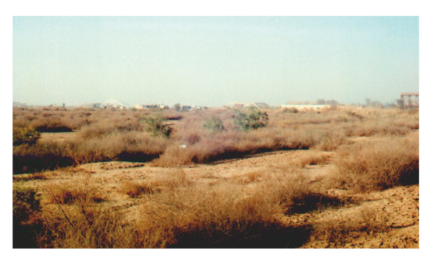
Fig. 2. Typical topography and environmental features found at TAB.

"Everything that does not move is covered in a grayish brown, powdery dust. The heat is oppressive—>120degrees in the shade, and the open fields and roads bear craters large enough to swallow small trucks. In March 2003, the area around TAB looked more like the surface of the moon than the bustling tent city and flight-line area standing today. After the base fell to coalition