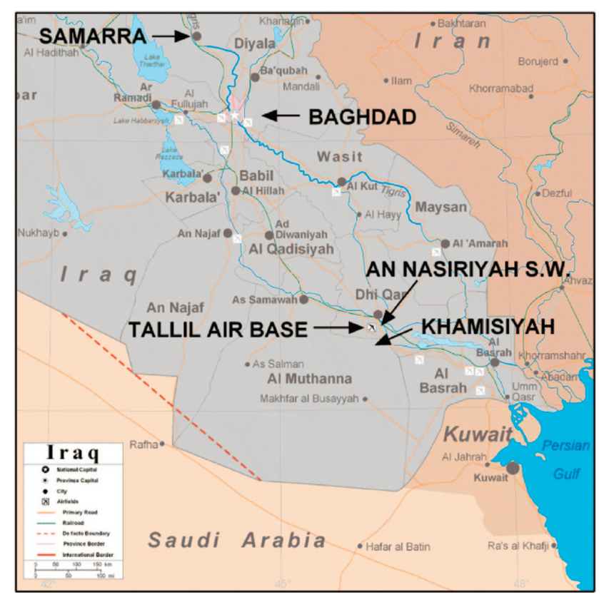
Fig. 1. Map of Iraq and Kuwait showing the location of TAB in relation to Baghdad and Kuwait City.

of semiarid desert (Fig. 2). The terrain is flat with <1-m natural variation in elevation over the 30 km<sup>2</sup> of the base. There are no natural sources of water (e.g., streams or ponds); however, there is a network of abandoned irrigation canals that hold water during the infrequent rains. Conditions at TAB were best described by an airman assigned to the 407th Air Expeditionary Force: