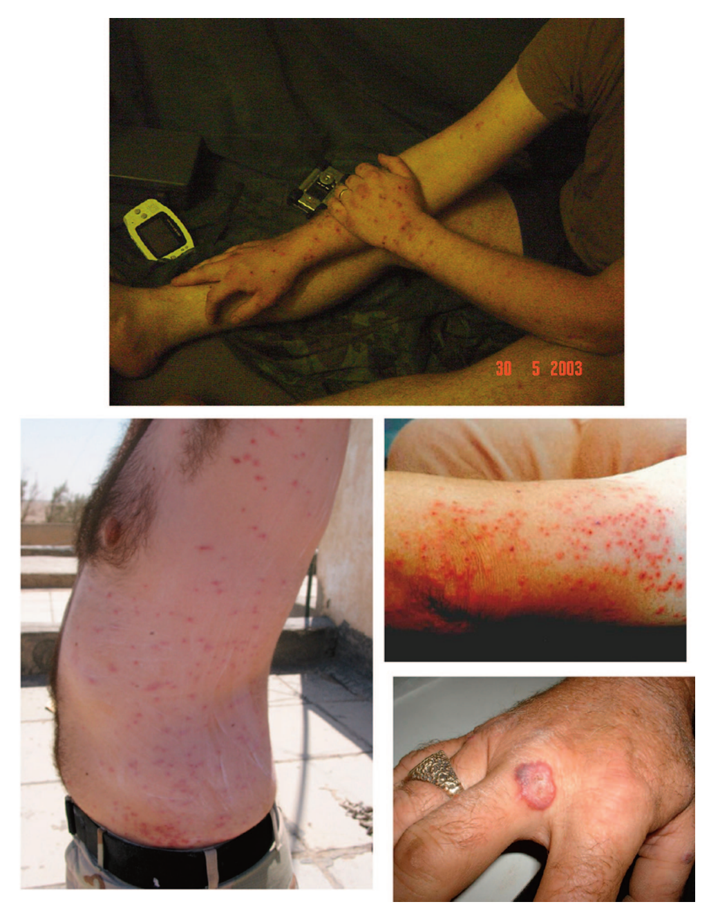
Fig. 5. Typical sand fly bites acquired during a single night on U.S. military personnel stationed at TAB in 2003.

dust occur frequently and adversely affect all activity (human and sand fly). The impact of environmental factors (temperature, wind speed and direction, relative humidity, cloud cover and moon phase) on sand fly activity will be evaluated in a subsequent article.