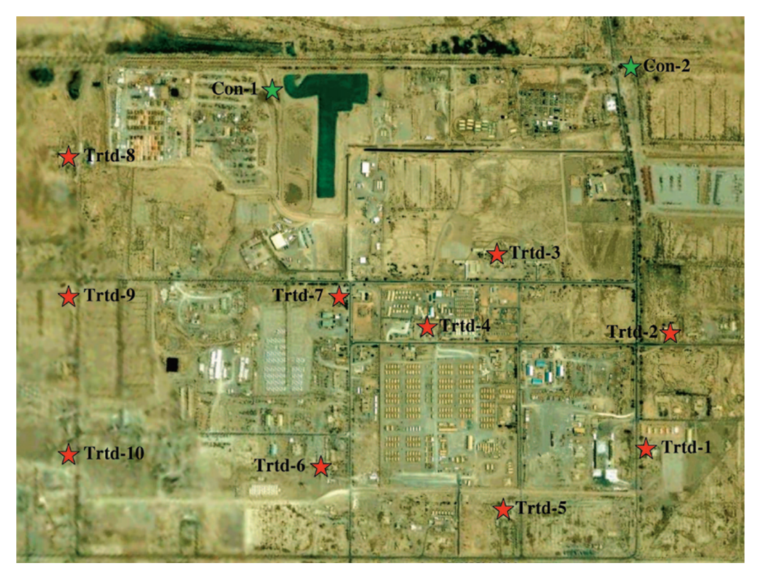
Fig. 6. Schematic map showing the layout of TAB and the locations of the standard traps used in sand fly surveillance.

2004, almost all personnel at TAB lived in air-conditioned tents or buildings.