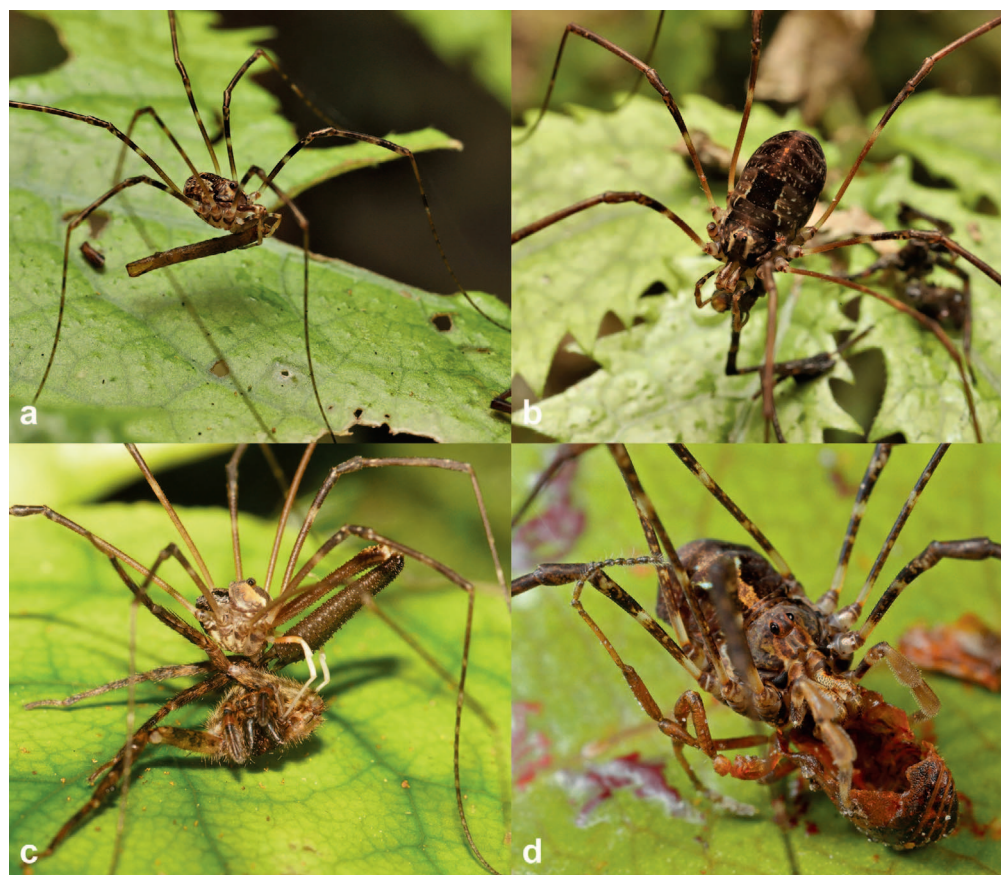
Figure 3.—New Zealand Neopilionidae with scavenged arachnid food items. (a) Juvenile Forsteropsalis pureora feeding on a leg of the sheet-web spider Cambridgea sp. (Desidae) in Waitomo. (b) Adult female F. pureora feeding on a leg of the spider Cycloctenus sp. (Cycloctenidae) in Waitomo. (c) Adult male F. inconstans feeding on scavenged Cycloctenus sp. (Cycloctenidae) in Lower Hutt. (d) Adult female Pantopsalis listeri feeding on scavenged remains of a short-legged harvestman (Triaenonychidae) in Westland.

Some neopilionids may also eat plant matter, such as detritus or vegetation, but we did not observe this in the field. In captivity, we found that F. pureora , F. bona , and P. listeri readily accepted wet dog food as well as plant matter including