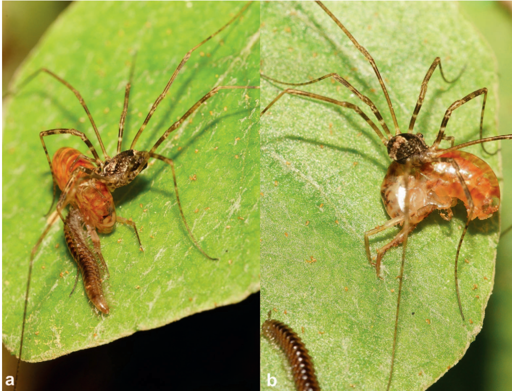
Figure 5.—Subadult male F. inconstans competing with a Schedotrigona sp. millipede over a scavenged amphipod in Lower Hutt. (a) Millipede and harvestman feeding on an amphipod. (b) The harvestman was successful in retaining the scavenged food and moved away from the millipede.

spiders, including two separate observations of an adult male of F. pureora trapped in the web of the sheet-web spider, Cambridgea sp. (Desidae) (Fig. 7d), and an adult male of P. phocactor trapped in the web of an unidentified araneoid spider (Araneidae or Theridiidae). A web-building pirate spider, Australomimetes sennio (Urquhart, 1891) (Mimetidae), captured a female of F. pureora in Rotorua (B. McQuillan pers. comm.). An adult male F. inconstans was observed being eaten by a cave orbweaver, Taraira (= Meta ) rufolineata (Urquhart, 1889) in Kahurangi National Park, Tasman (D. Hegg pers. comm.). Finally, in Lower Hutt, Wellington, an adult male of F. inconstans was captured and eaten by a cobweb spider, Theridion zantholabio Urquhart, 1886 (Theridiidae) (U. Schneehagen pers. comm) (Fig. 7b).