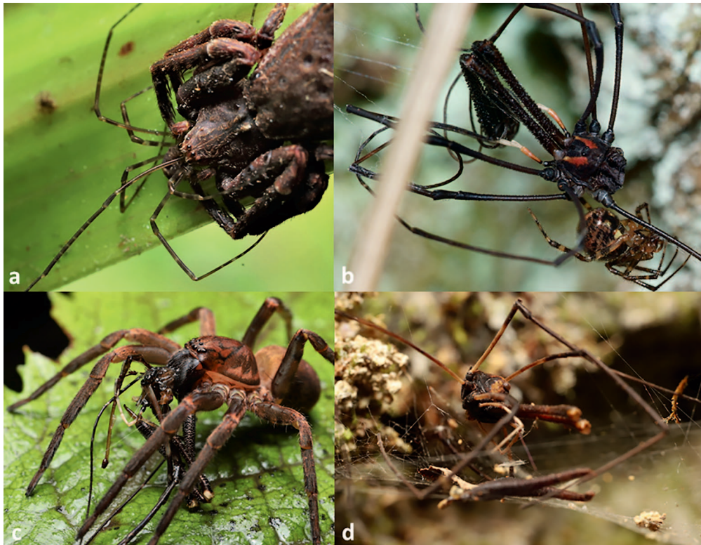
Figure 7.—Invertebrate predators of New Zealand Neopilionidae. (a) Female of the square-ended crab spider Sidymella angularis (Thomisidae) consuming a juvenile Forsteropsalis chiltoni in Oban, Stewart Island. (b) Forsteropsalis inconstans male captured and eaten by a female cobweb spider Theridion zantholabio (Theridiidae) in Muritai, Lower Hutt. (c) Adult female of the brown vagrant spider Uliodon sp. (Zoropsidae) feeding on a male F. pureora prey in Ngaruawahia. (d) Adult male F. pureora in the web of the sheet-web spider Cambridgea sp. (Desidae) in Te Angra.

Another example of the opportunistic feeding habits of neopilionids is the fact that juveniles and adults of at least two species, F. bona and P. listeri , feed on their exuvia after molting. Early nymphs of many harvestman species are known to feed on their exuvia after molting or simply to masticate them, which is possibly a strategy to recover water (Gnaspini 2007). To our knowledge, however, there is no reported case of later nymphs and adults of harvestmen feeding on their exuvia. As opportunistic scavengers that will feed on low-quality food when it is available, it is possible that neopilionids use their exuvia as a source of food and not water.