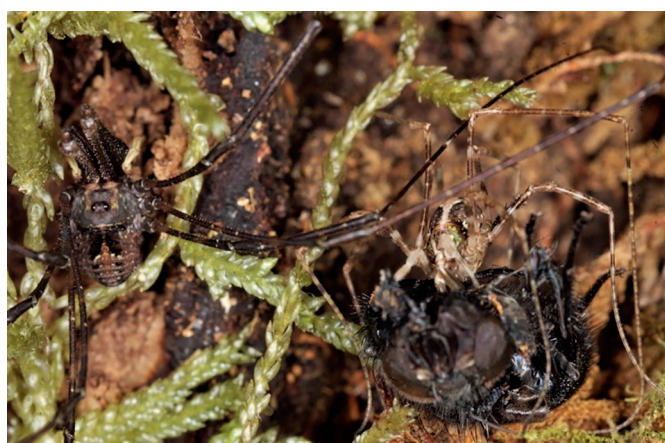
Figure 4.— Pantopsalis listeri male and female with scavenged blowfly food. The male began by opening the cuticle of the prey item, exposing the soft integument. He then backed away and the female stepped forward to feed.

Some neopilionids may also eat plant matter, such as detritus or vegetation, but we did not observe this in the field. In captivity, we found that F. pureora , F. bona , and P. listeri readily accepted wet dog food as well as plant matter including