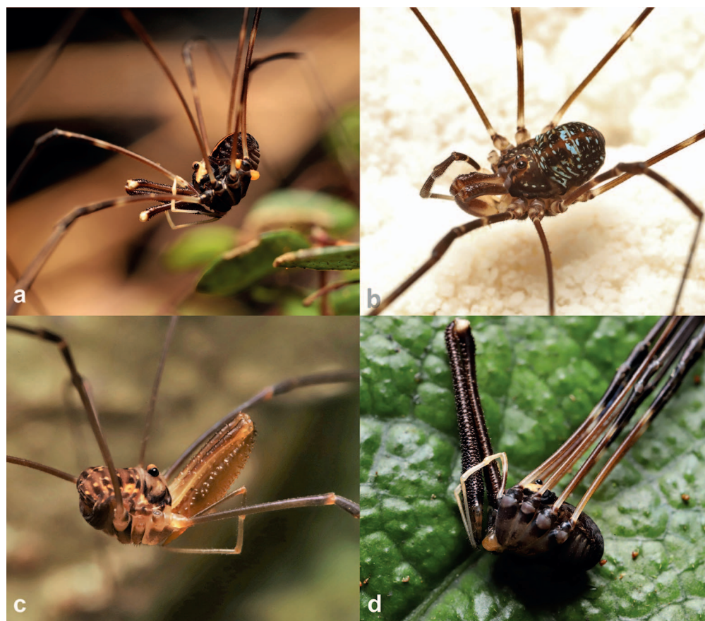
Figure 8.—Predator damage and defense strategies of New Zealand Neopilionidae. (a) Adult male Forsteropsalis pureora with broken left chelicera and possible autotomized left leg (2 nd pair) in Waitomo. (b) Juvenile F. bona missing its left pedipalp and autotomized right leg (1 st pair). (c) Adult male Mangatangi sp. with two autotomized legs. Legs II and III have been autotomized at different times over the harvestman's life. Leg II was recently autotomized, as evident by the remaining trochanter joint. Leg III was autotomized during the juvenile stages, evident by the missing trochanter and healed cuticle "scar". (d) An adult male F. pureora utilizing the defensive posture known as thanatosis.

predators of Opiliones in the country, including seven spider species and the cannibalism of juveniles and adults (see the previous section 'Diet'). The spiders we found to feed on harvestmen were opportunistic generalist predators of invertebrates and are unlikely to specialize on harvestman prey.