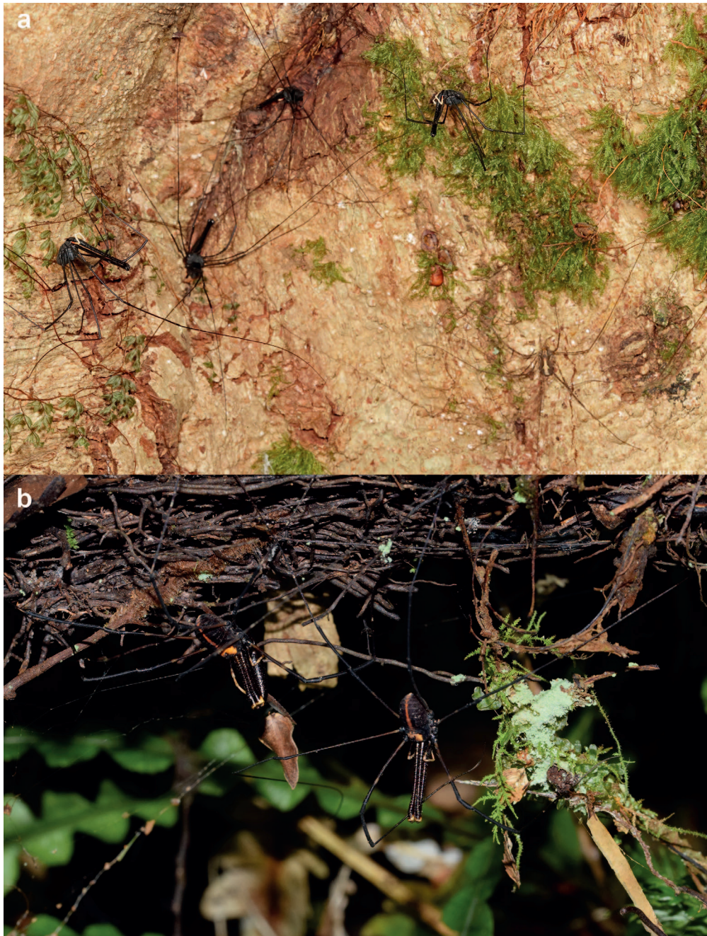
Figure 9.—(a) Aggregation of sexually mature Pantopsalis listeri in Westland, South Island, New Zealand. On the left, four adult males and on the right, two females (with more cryptic coloration). (b) Two sexually mature male Forsteropsalis pureora at Waioeka Gorge, Bay of Plenty.

members of the genus Forsteropsalis , are often associated with aquatic environments such as streams, waterfalls, dams, and gorges, and it is plausible that these species would be encountered by climbing fish. For instance, we have found F. fabulosa in rock wall crevices receiving spray from nearby waterfalls and have commonly encountered F. bona , F. pureora , and F. marplei resting on and around the banks of streams day and night.