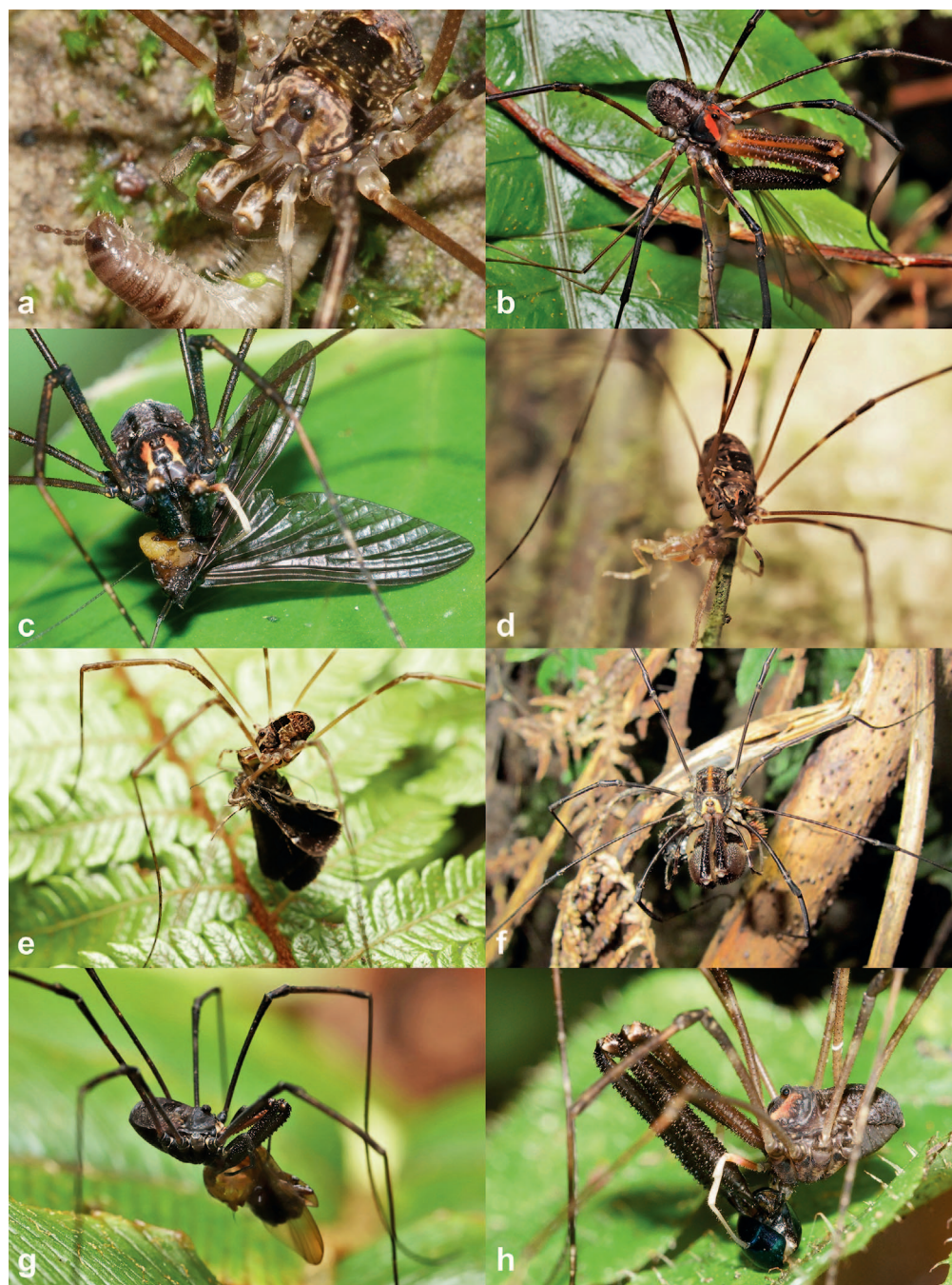
Figure 1.—New Zealand Neopilionidae with an assortment of freshly captured invertebrate prey. (a) Subadult male Forsteropsalis inconstans feeding on a millipede, Schedotrigona sp. (Diplopoda: Metopidiotrichidae), in Lower Hutt. (b) Adult male F. chiltoni feeding on a large crane fly (Diptera: Tipulidae) in Oban, Stewart Island. (c) Adult male F. inconstans feeding on a mayfly (Ephemeroptera) in Upper Hutt. (d) Adult female F. bona feeding on a small wētā (Orthoptera: Anostomatidae) nymph in Waitomo. (e) Juvenile F. pureora feeding on a moth (Lepidoptera) in Waitomo. (f) Adult male F. bona feeding on a blow fly (Diptera: Calliphoridae) in Waitata, Bay of Plenty. (g) Adult male Pantopsalis phocator feeding on a fly (Diptera) in Dunedin. (h) Adult male F. inconstans feeding on a steelblue ladybird prey, Halmus chalybeus (Coleoptera: Coccinellidae), in Lower Hutt.

interesting because millipedes rarely consume animal matter (Hopkin & Read 1992).