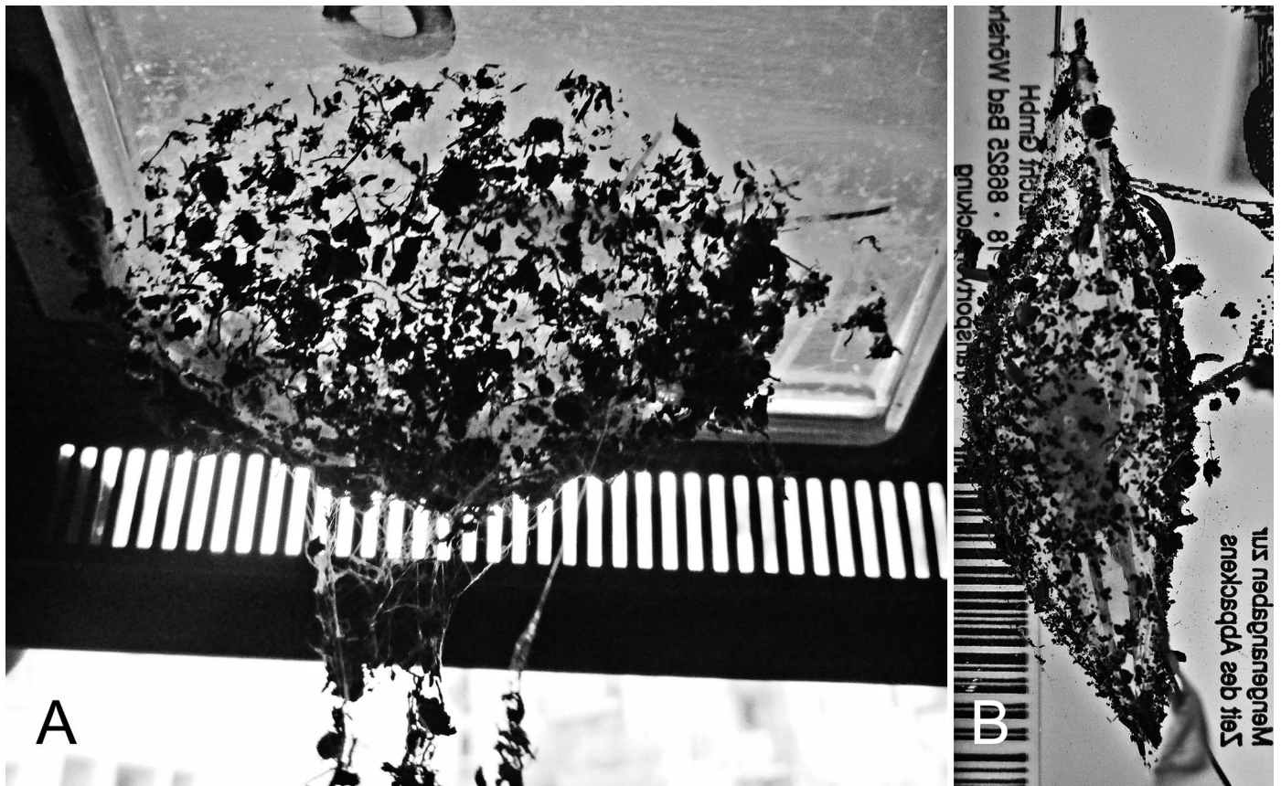
Figure 2.—Inhabited silken retreats of Viridasivus sp. from below, built in captivity. (A) subadult male kept on potting soil, (B) juvenile (body length ~13 mm) kept on coco humus and sand

Brescovit 2000, Zimmermann & Spence 1992). Ctenus medius Keyserling, 1891 was found during the day sitting under rocks and tree trunks, while wandering around at night (Almeida et al. 2000), similar to Phoneutria boliviensis (F. O. Pickard-Cambridge, 1897) (Hazzi 2014). Therefore, the herein described silken retreats of Viridasivus sp. are more similar to those found in several dionychan spider families, and corroborate the classification of Viridasiidae as members of the Dionycha (Polotow et al. 2015, Wheeler et al. 2017).