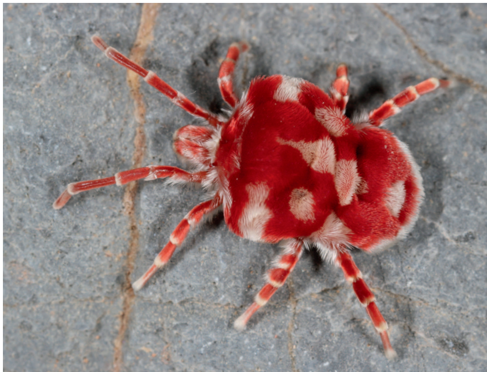
Figure 1.—Giant velvet mite, likely Dinothrombium magnificum .