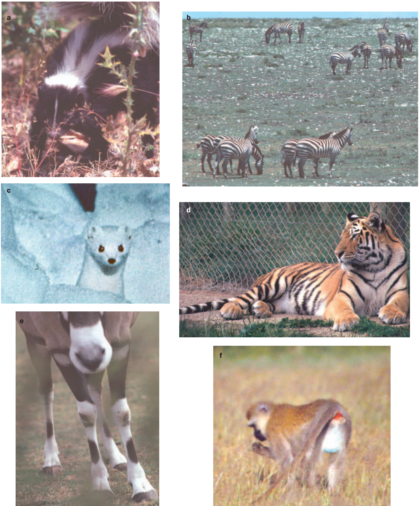
Figure 1. Striking examples of mammalian coloration: (a) striped skunk (photograph: © 1989 Jeff Wilcox, used with permission), (b) Burchell's zebra (photograph: Tim Caro), (c) ermine (photograph from the collection of the Museum of Wildlife and Fish Biology, University of California–Davis, used with permission), (d) tiger (photograph: Tim Caro), (e) beisa oryx (photograph: Tim Caro), and (f) vervet monkey (photograph: © 1987 Lynne Isbell, used with permission).