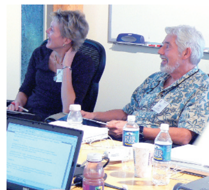
Fall colors are evident outside the window as the working group, “Towards an Integrated Database for Fish Evolution,” meets inside one of NESCent’s conference rooms (top).