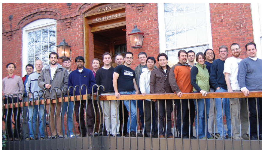
The programmers and biologists who attended a five-day “phyloinformatics hackathon” stand outside the old Erwin Cotton Mills building, now home to NESCent.

Just over two years ago, the National Science Foundation (NSF) established NESCent, granting $15 million over five years to foster and encourage what it termed “a grand synthesis of the biological disciplines through the unifying principle of descent with modification.” The intent: Do for evolutionary biology what