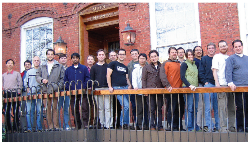
The programmers and biologists who attended a five-day “phyloinformatics hackathon” stand outside the old Erwin Cotton Mills building, now home to NESCent.

Just over two years ago, the National Science Foundation (NSF) established NESCent, granting $15 million over five years to foster and encourage what it termed “a grand synthesis of the biological disciplines through the unifying principle of descent with modification.” The intent: Do for evolutionary biology what