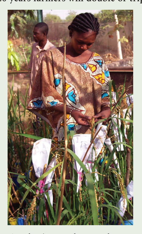
A student intern makes crosses between African and Asian rice at the Sikasso Research Center in Mali. In Africa, there is one indigenous rice species, Oryza glaberrima, which was domesticated in the northern Niger valley by Africa's first farmers. An introduced Asian species, Oryza sativa, is currently the dominant rice species in Africa.

The population of sub-Saharan Africa is growing, with about 70 percent now living in rural areas, yet African agriculture is not growing fast enough to meet the dietary needs of African communities or provide farmers with sufficient livelihoods. Numerous episodes of pre- or postharvest hunger, extreme environmental stresses such as drought and intense pest and weed infestations, and the insufficiency of global trade for African food needs further weaken the agricultural situation in Africa. In re-