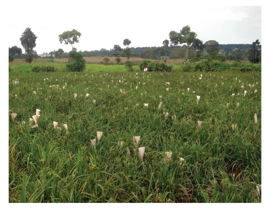
In these test plots at the Kenya Agricultural Research Institute, Chrispus Oduori Adeti is breeding for higher yield and resistance to the fungal disease neck blast. Finger millet is an important food crop because of its long-term storage capacity and its high nutritive value, making it important in the diets of children and expectant and breastfeeding mothers.

gen populations." Currently, he says, "work is at the phase of conducting field trials for the lines [246 in number] we have so far established from our various breeding crosses using the conventional breeding methods. We are conducting participatory, variety selection trials with the farmers so as to address the farmer requirements, and at the same time evaluating the lines for the various biotic and abiotic stresses."