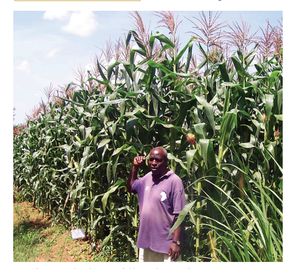
A farmer stands in his maize field near the town of Bungoma, in western Kenya. The hybrid white maize growing in this field produces about three times the average yield. It is most commonly used for porridge. Maize and cassava are the two most important crops in Africa, with the highest maize consumption in eastern and southern Africa.

Another breeder, Chrispus Oduori Adeti, focuses on finger millet in western