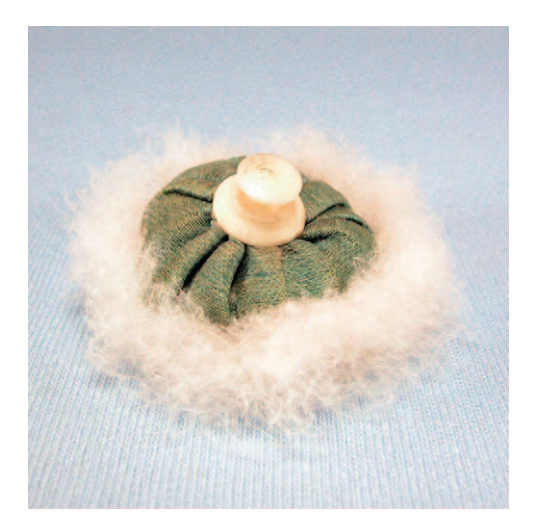
FIGURE 2. A powder puff made of swan's down.

then the cat deserves consideration but if the keeping of cats is to be regarded as merely a 'luxury' or if they are proven to be more noxious than beneficial to wild-life then their possession should be guarded with stringent restrictions, embodying registration or taxation." He concluded: "Is it not time that the sportsmen, the Department of Agriculture, and the Audubon Societies join forces in giving the cat question serious attention?"