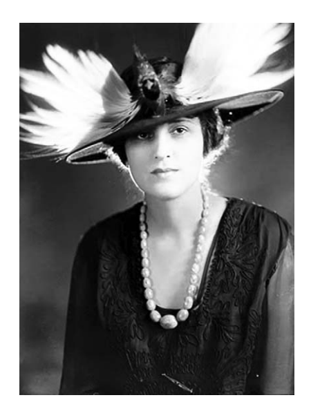
FIGURE 1. Woman with bird hat circa 1900. The bird is a near complete specimen of either a Great ( Paradisaea apoda ) or a Lesser ( P. minor ) bird-of-paradise (fide Bruce Beehler).

Other countries soon tried to follow the United States' lead ( The Auk 31:289). It was reported that Parliament in Great Britain was considering a law banning importing feathers. The great German naturalist Carl Georg Schillings wrote that the United States had found the only solution to the problem and that if Great Britain banned