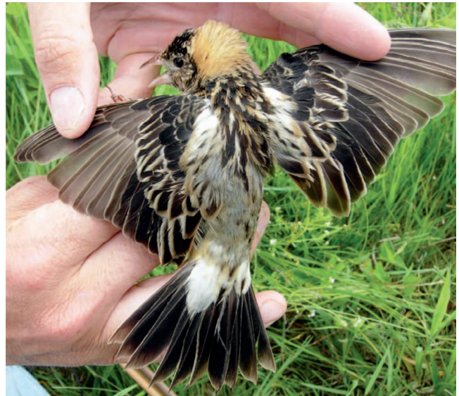
FIGURE 1. A female Bobolink in male-like plumage.

Bergtold had another interesting note (33:439) about “pseudo-masculinity” in the Spotted Towhee ( Pipilo maculatus ). He had collected what he thought was a male of the species, although with light colors, but upon preparing the specimen it turned out to be a female with perfectly functioning ovaries. The literature on this phenomenon at the time (e.g., Bland Sutton 1890) suggested that the ovaries should be diseased or damaged